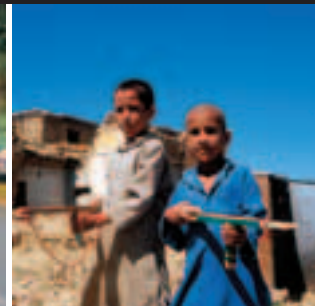
Help today, make a commitment to tomorrow.

1859 1861 1864 1900 1914 1918 1939 1940 1941 1942 1943 1944 1945 1949 1967 1970 1974 1976 1979 1982 1984 1985 1987 1991 1994 1997 1998 1999 2000 2002