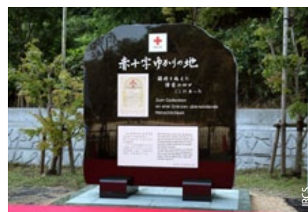
A monument placed at the site of Bando detention shows the presence of the Red Cross