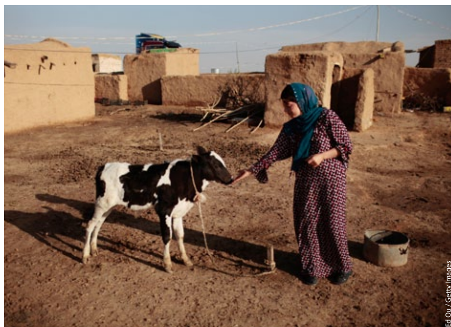
Kirkuk, Iraq. A woman feeds a cow that was donated to her by the ICRC as a micro-economic initiatives programme. During a picnic near the Iranian border in 2001, she stepped on a landmine and lost a leg.

As he leaves Iraq after two years, he concludes ICRC's work in Iraq as follows. "As the country develops its great economic potential, the ICRC has scaled back and focused its assistance services. Nevertheless, we will continue to reach out to vulnerable groups and areas, and to provide the authorities with technical advice on how essential services can be improved. Dialogue with the various authorities is good and continues to develop. Being present on the ground is necessary to be able to help efficiently. The context is complex and sometimes dangerous owing to the armed conflict and other violence. Nonetheless, it is still possible to carry out humanitarian activities there."