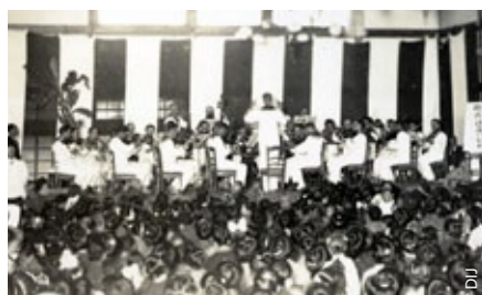
POWs in Bando detention playing the symphony

to buy even the essential goods for life. They thus heavily depended on money and valuables from their relatives and friends back home, for which the ICRC played a vital role in transfer. The goods collected by the ICRC's Central Agency for POWs in Geneva were then sent to The Committee for POWs established by the Japanese Red Cross Society, and to the POWs through the cooperation with the Japanese Imperial Information Office of POWs. With this financial support from their families and friends abroad, soldiers could buy alcohol and cigarettes and enjoy them with other prisoners.