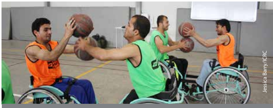
The Afghan players at a basketball practice session at the ICRC Orthopaedic Centre, Kabul

The month of May 2014, was a benchmark in the lives of a handful of young men from Afghanistan who comprise the national wheelchair basketball team. These men — who have been affected physically by disease, disaster or conflict and have been rehabilitated by the ICRC — had gone to Italy at the invitation of Italian sports club Briantea84 to play in a series of matches between 22-29 May.