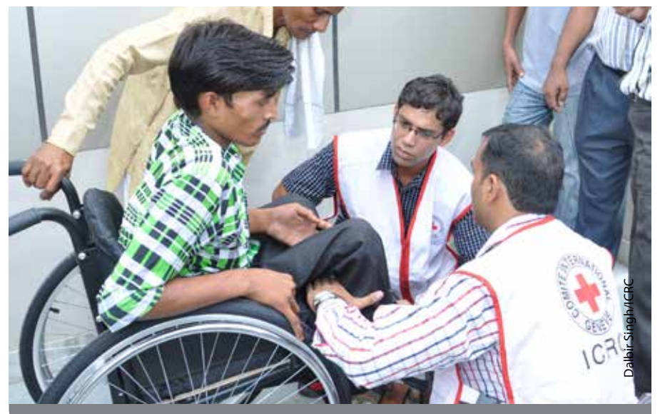
The ICRC in cooperation with the Centre for Empowerment and Initiatives provided wheelchairs to persons with disabilities in Noida (UP) in Noida (UP)