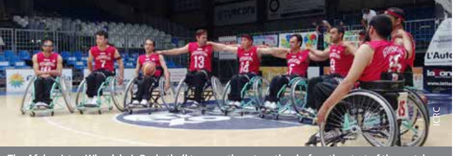
The Afghanistan Wheelchair Basketball team gathers together before the start of the match

In India, too, the ICRC's Physical Rehabilitation Programme contributes to the social reintegration of people with disabilities into society by providing them with appropriate physical rehabilitation care. Partners of the ICRC working for disabled people have been empowered by the organisation to provide quality services including the development of sustainable resources. The ICRC's Physical Rehabilitation Programme is now being shaped to enhance the accessibility of disabled people to affordable treatment by utilizing appropriate technology. The ICRC implements projects through these activities as per the priority of the Department of Disability Affairs Ministry of Social Justice and Empowerment, Government of India.