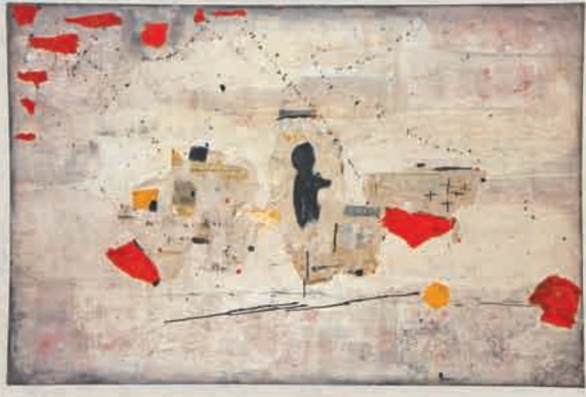
Shadows of the future, tempera and paper on canvas, 152 x 101 cm.

Shadows 1 Tempera and paper on canvas, 40 x 161cm