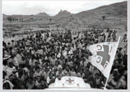
Ethiopian Civil War/Famine. Internally displaced people wait to register for food aid in Adwa. 1985.