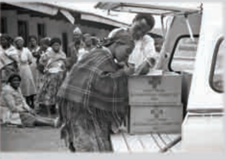
South Africa. Natal Province. Assistance being handed out by the South African Red Cross Society and the ICRC. 01/11/1992.