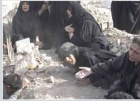
Iraq. Families mourn relatives in a makeshift cemetery in Basra. 2003.