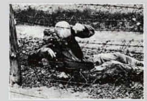
Germany, Second World War. Concentrationcamp prisoner on a high-voltage electrified fence.