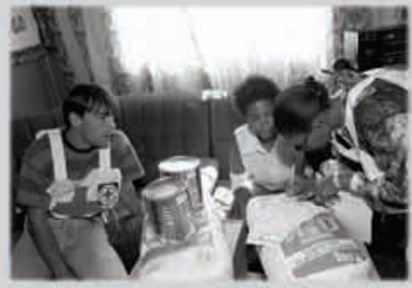
South Africa. Sebokeng township, Johannesburg. Distribution of food parcels. 27/01/1992.