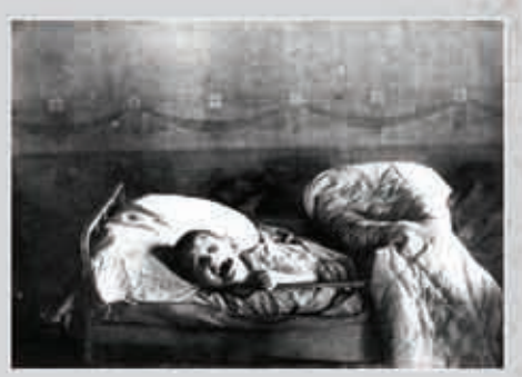
Famine in Russia. 1922. ICRC