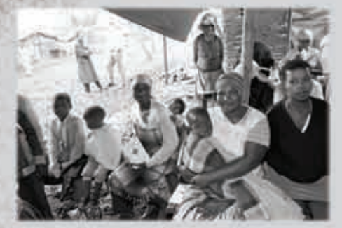
South Africa. Durban. Township in Bambayi. 01/05/1993.