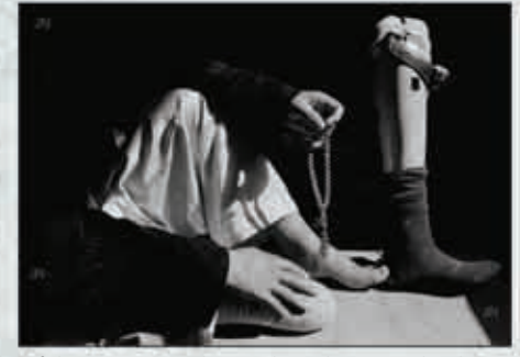
Afghanistan. Landmines have been used indiscriminately for the last three decades and have left an estimated 100 000 people disabled 2009.