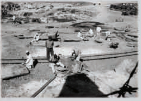
South Africa. Robben Island. Stone quarry. 10/04/1967.

South Africa. Robben Island. Stone quarry. In the