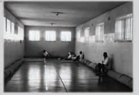
South Africa. Robben Island. Visit of the prison, the "H" block. 10/04/1967.