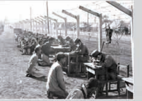
Korean War. South Korean military police interrogate North Korean prisoners of war in Pyongyang. 1950.