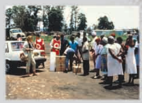
South Africa. Katlehong (East Rand). Old Cross Road Squatter camp. Distribution of relief goods. 01/1991.