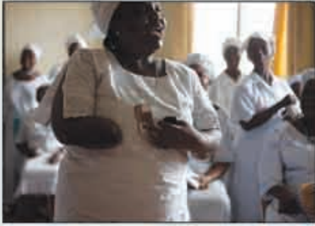
Liberia. Through Liberia's Trauma Healing and Reconciliation programme people share their experiences and use singing and dancing to come to terms with their painful past. 2009.