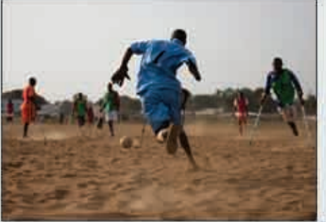
Liberia. Amputee football has been the source of enormous hope and solace for one of the most marginalized groups in the country. 2009.