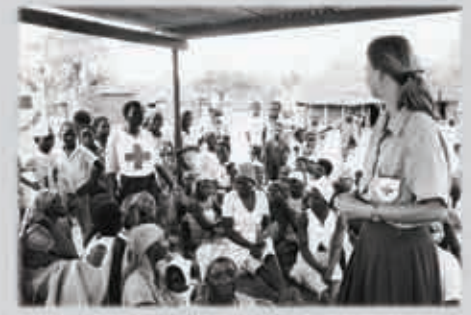
South Africa. Xitlakathi. An ICRC delegate gives an information session to mozambican refugees in a refugee camp. 01/01/1992.