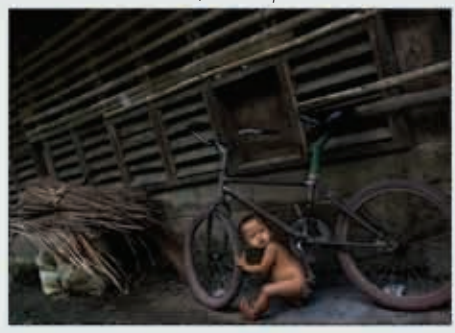
Philippines. A child displaced by warfare in one of the camps for internally displaced. 2009.