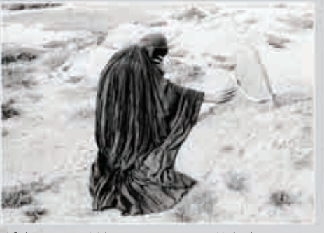
Afghanistan. Military cemetery in Kabul. 1998.