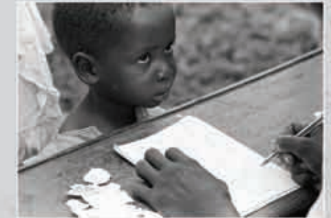
Nigeria, Biafra conflict. A child waits for milk and fish vouchers in a feeding centre.1968.