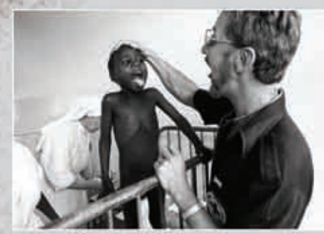
Zimbabwe. ICRC doctor examines a child. 1979.