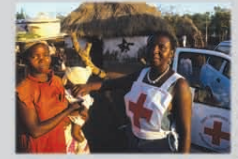
South Africa. Hlupekani near Giyani. The Soweto Branch of the South African Red Cross Society and the ICRC gives assistance to refugees. 1992.

background the group of prisoners who smash the