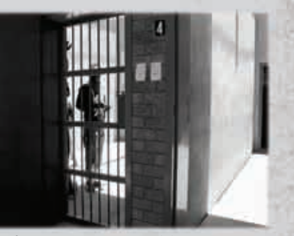
South Africa. Pretoria. An ICRC delegate visits detainees in police cells. 01/11/1992.