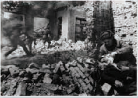
Second World War. Fighting in Stalingrad. 1942.