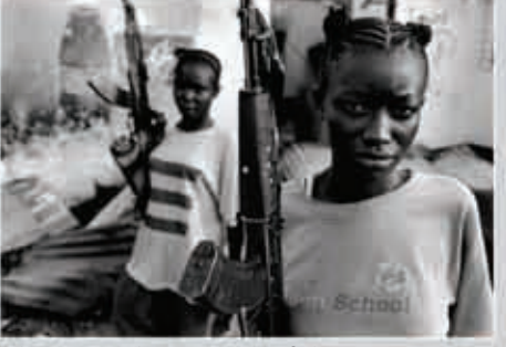
Liberia. Female government fighters in Ganta, near the border with Guinea. 2003.