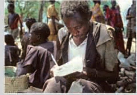
Uganda. An internally displaced man writes a Red Cross message to family members. 1984.