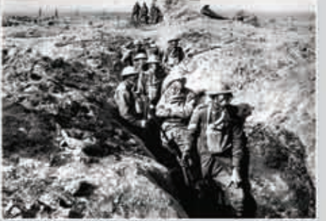
France. First World War. Australian troops prepare for gas attack near Ypres. 1917.