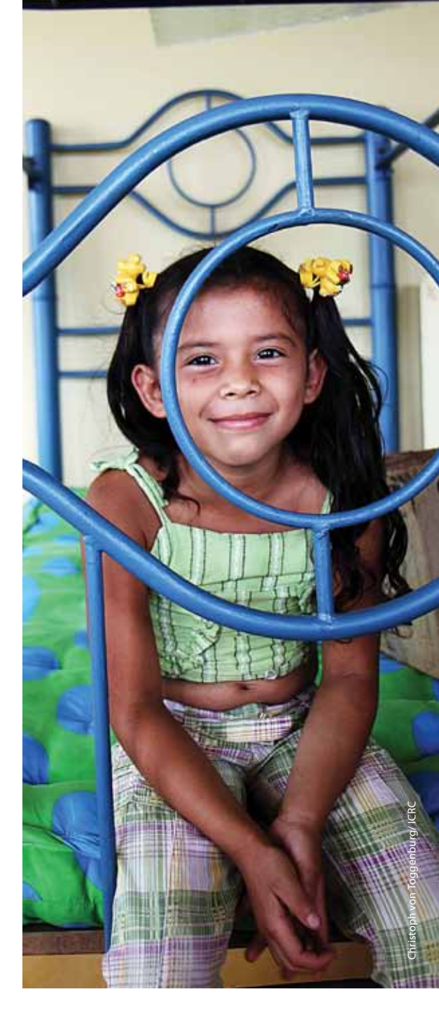
ICRC - Annual Report 2009

In some rural areas, however, school boarding houses prove essential. They keep the children out of danger, boost academic performance and help improve the families' financial situation.