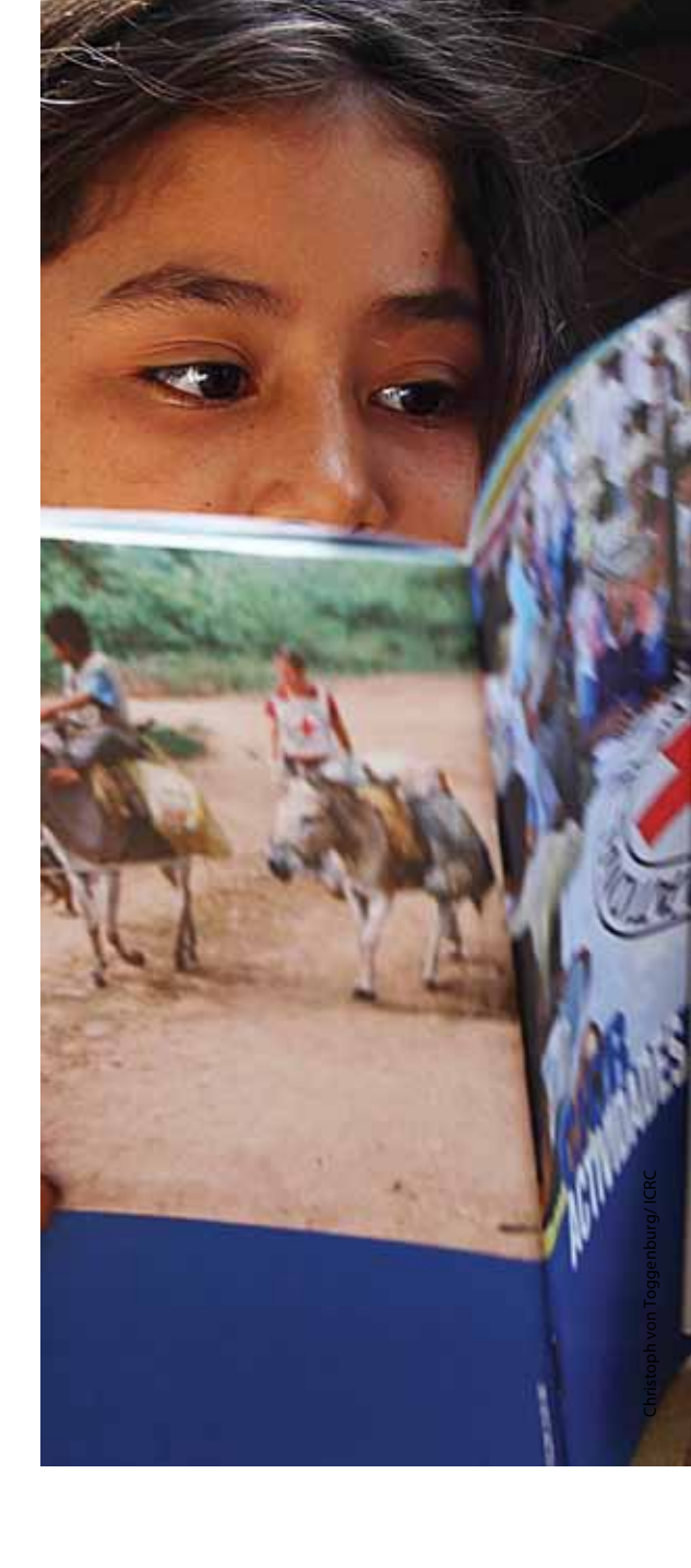
ICRC - Annual Report 2009