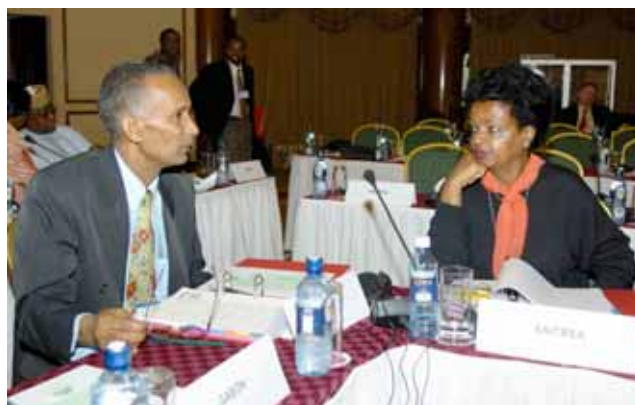
Delegates from Eritrea and Ethiopia exchange views and news during the conference. Families in both countries have experienced loss and separation due to conflict.

or visit our special ICRC webpage on family links: www.icrc.org/eng/rfl-conferences