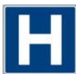
3. Hospitals white capital "H" on a blue background