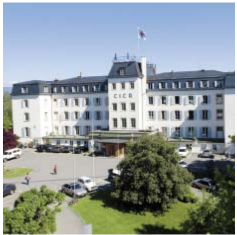
Left The ICRC distributing water in Adré, Chad. Right View of the Geneva headquarters of the Comité International de la Croix-Rouge (CICR/ICRC).