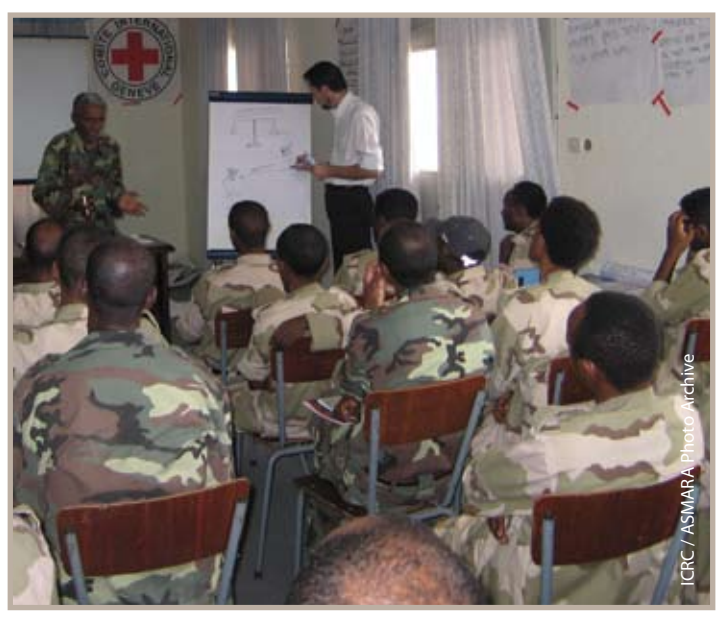
IHL course, Eritrean Defence Forces trainers, Embatkalla.