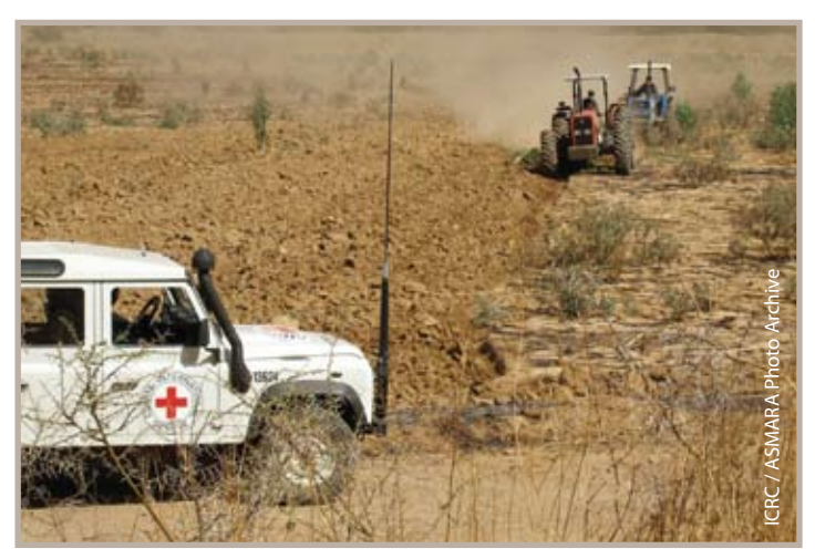
Tractor ploughing in Debub region.

Some 8,000 struggling families in Debub region, most of them headed by women, had their fields ploughed in May and July, ahead of the planting season, by tractors hired by the ICRC. The