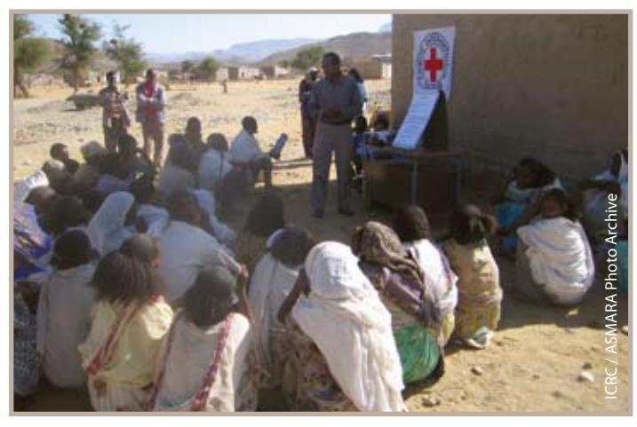
Dissemination to kudo Weyba and Una Nazo ICRC housing project beneficiaries, Debub Region.

Opinion-makers and the general public took part in information and dissemination sessions to generate support for IHL and the work of the ICRC and the Red Cross and Red Crescent Movement. IHL promotional material was handed over to them.