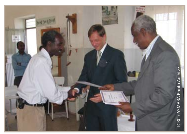
Certificate handing over ceremony Refresher Course for physiotherapists, Asmara.

4 refresher courses for 43 physiotherapists conducted by the ICRC in coordination with Ministry of Health to help Eritrea meet the demand for physiotherapy services.