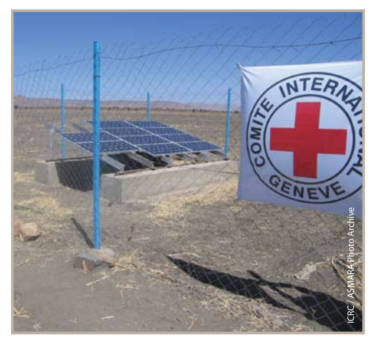
Solar- powered water supply system built by the ICRC, Berik Hutsa, Debub Region.