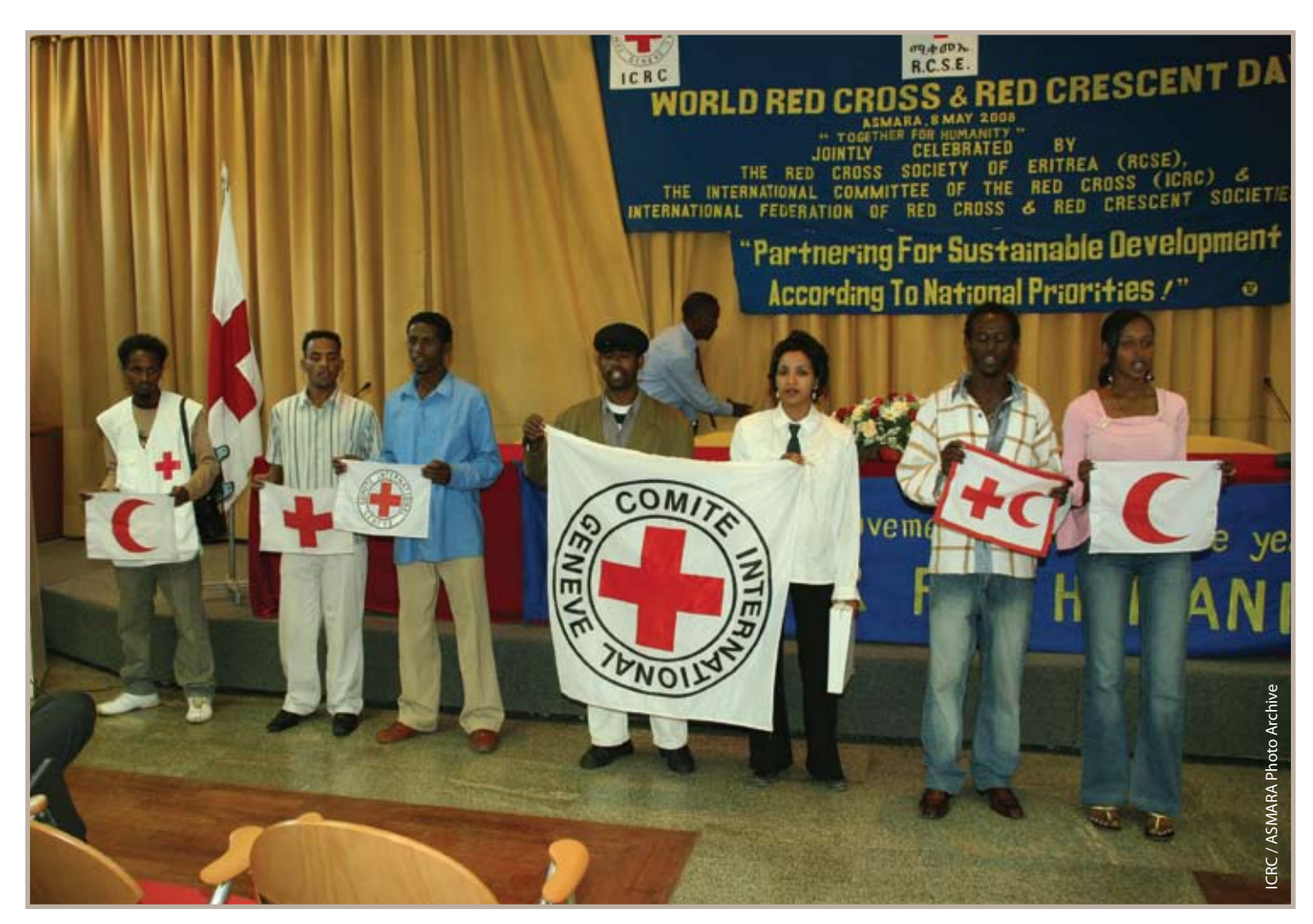
World Red Cross and Red Crescent Day (8th of May) Celebration, Asmara.

In September 2008, with financial support of the ICRC, the Law and Fundamental Principles department of the National Society resumed its basic dissemination sessions which targeted 390 officials and business community members, 614 community members, 6100 students and 90 governmental officials with the aim of informing the general public on the Red Cross and