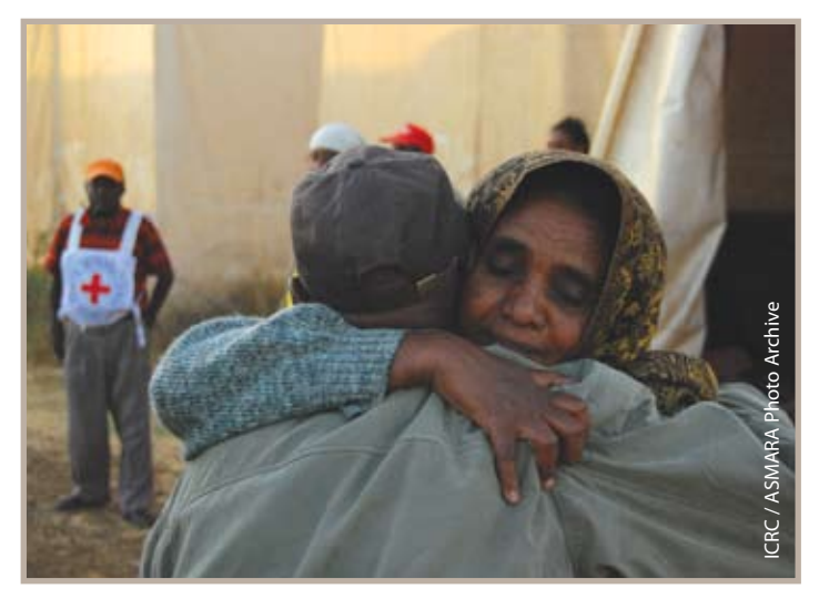
Family reunion from Ethiopia to Eritrea, Mendefera transit camp.

The two POWs of Ethiopian origin captured by Eritrean forces in late December 2007 during a border skirmish were visited by the ICRC, with the Eritrean government's approval and according to the organization's standard procedures. The delegates monitored detention conditions, and both were able to exchange messages with their families. The ICRC also monitored the situation of the few remaining former POWs who had declined repatriation in