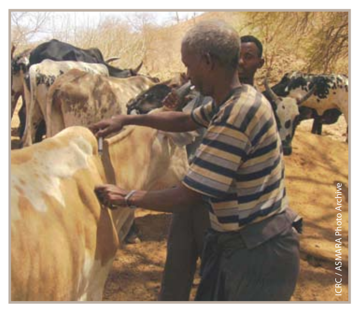
Anti-parasite treatment of livestock, Debub Region.

To strengthen the physical condition of livestock before the rainy season the ICRC planned to inoculate with parasites control drugs 470,958 animals belonging to 18,908 households living in border areas in two phases (before and after the rainy season). Because of the lack of fuel availability that hampered the implementation of the project only the first phase of the programme was implemented.