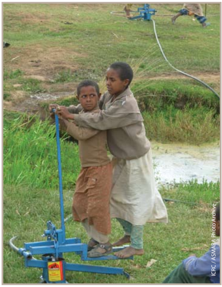
Distribution of foot pump to gardeners in border areas, Senafe sub zone, Debub Region.