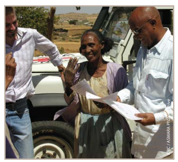
Distribution of Red Cross Message to a family in Debub Region.

Families separated by the war continued to be able to communicate across the closed Eritrea-Ethiopia border through the tracing and RCM services. At their request, people of Eritrean or Ethiopian origin were repatriated and the children, the elderly and the sick, reunited with their families across the border, under ICRC auspices. This remained their only legal means of returning to their country of origin. Following ICRC interventions, both governments continued to approve the reunification of couples of mixed origin. This mainly concerned women of Eritrean origin joining their husbands in Ethiopia, but in March, for the first time, a woman of Ethiopian origin, with her nine-year-old son, was reunited with her husband in Eritrea. Prior to repatriations, 148 needy people obtained their exit visas from Eritrea with ICRC financial support. People also had their official documents forwarded so that they could apply for jobs or pursue their studies.