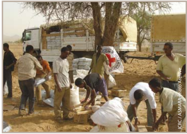
Distribution of temporary shelter and essential household items, Debub region.

Returning or resettled families were able to set up home in the border area using tarpaulins, rope, blankets, jerry cans and soap provided by the ICRC. The assistance was coordinated with the authorities, UNDP, which financed the transport of the former IDPs, and UNICEF, which rehabilitated health posts and schools. Temporary shelters and essential households' items were distributed to 22,989 individuals representing 5,599 households among whom 12,830 individuals representing 3,005 households were assisted twice.