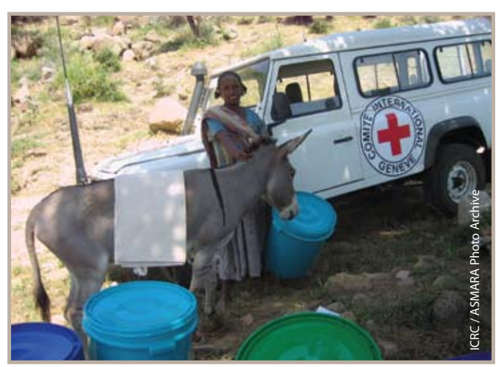
Distribution of donkeys and Jirbas, Debub Region.

Poor families in the border region who live far from a water point were given donkeys and a large water container. This allowed women and girls to fetch more water in a shorter time, which freed them up for other productive activities. Families also used the donkeys to collect and carry crops, firewood and fodder, and take products to market to sell or barter.