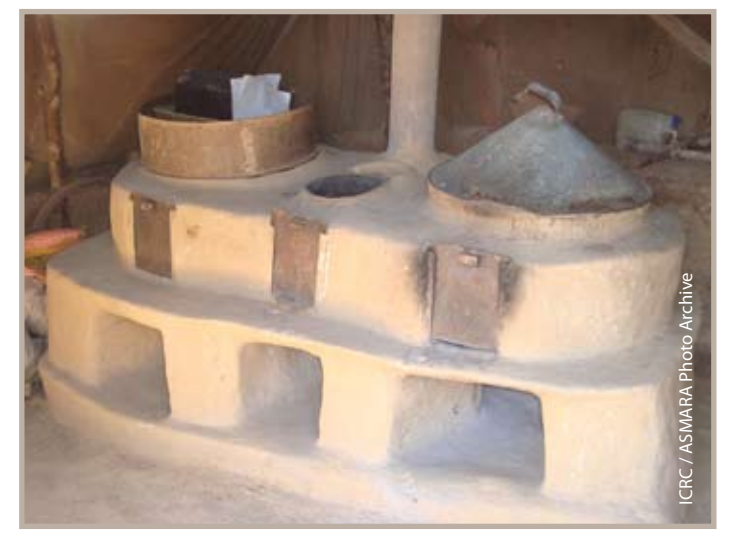
Energy saving oven built for resettlers, Tsorona Subzone, Debub region.

The ICRC distributed all the materials (sand, gravel, stones, cement, hollow blocks, nails, and iron sheets) and provided technical and financial assistance to IDPs that have been resettled to areas where no shelter was available. The beneficiaries are responsible for the construction of the houses. The financial contribution (an incentive of 4000Nakfa per family) was distributed directly to the