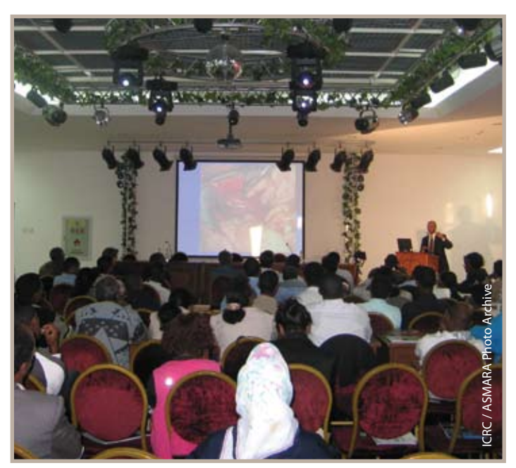
War Surgery Seminar, Asmara.