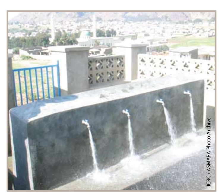
Solar-powered water supply system built by the ICRC, Aklelet, Gash – Barka region.

21'100 persons benefited from improved access to drinking water through the construction of 8 solarpowered water supply systems, the drilling of 4 boreholes, the construction of 1 water catchment's dam, the construction of 1 semi-urban water supply system and the reparation of 1 dam.