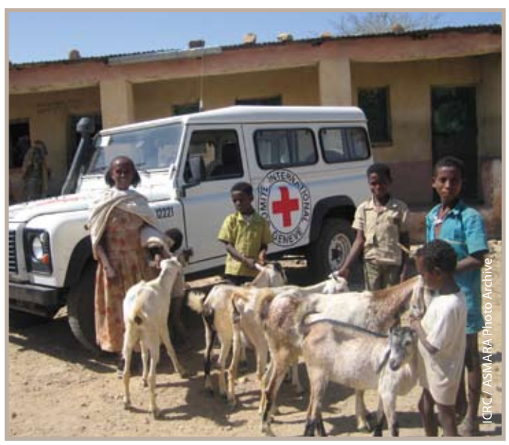
Distribution of goats to returnees to the border area, Debub Region.

Other families opted to receive goats from the ICRC. The animals are resilient and need little upkeep, which facilitate their survival in lean periods, and provide milk and meat, or can be sold. To increase the availability of meat, milk and income, the ICRC distributed 5 goats (each) to selected households with extremely low income.