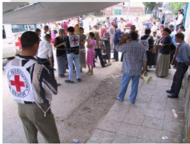
Verification in Sleptsovskaya

In line with the ICRC strategy to shift from blanket distributions to more targeted assistance, a verification and beneficiary update of the caseload of beneficiaries was completed over this summer. With this data, the ICRC will be able to gradually shift its help to those identified as the most vulnerable, within the overall IDP population today.