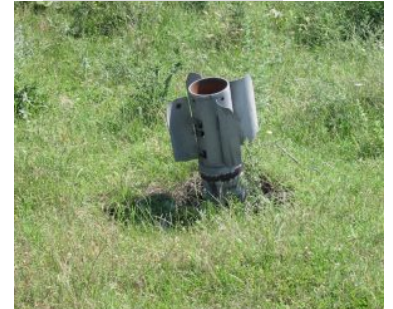
People must know how to behave in case they see mines or UXO