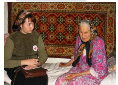
RRC nurses visit elderly people