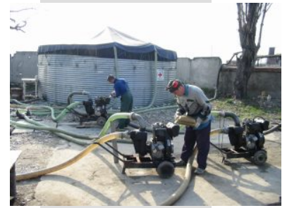
The pumping station No.1 in Grozny

In late 2000 the ICRC has rehabilitated the pumping station No.1 in Grozny. The station continues to supply over 35'000 residents of the city with chlorinated water with an average daily output of about 700m 3 . In September the total output of potable water distributed from the pumping station was 23'100 m 3 .