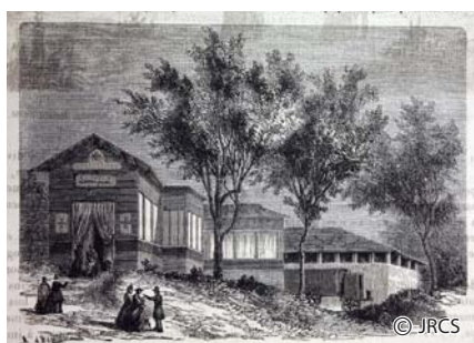
Paris World Expo

Also present at the event was the newly established International Committee for Relief to the Wounded (the predecessor of the ICRC). Two of the Japanese representatives, Tsunetami Sano of the Saga clan and Ryouun Takamatsu from the Edo government, took an interest in the organisation and its principles.