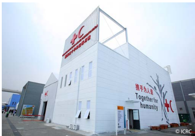
Top : Outside the pavilion

By learning to look from the humanitarian viewpoint, participants understand the need for rules during armed conflicts. They also see how international humanitarian law applies to situations of conflict and what it says about limiting the impact of war on vulnerable groups. Finally, they are able to connect the ideas that they learnt together and relate them to events in their daily lives.