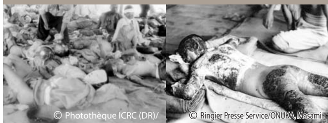
The scene of Hospital in Hiroshima after atomic bombing

On 8 July 1996 the International Court of Justice, the principal judicial organ of the United Nations, gave an Advisory Opinion about the Legality of the threat or use of nuclear weapons. In its opinion, ICJ stated "there is in neither customary nor conventional international law any specific authorization of the threat or use of nuclear weapons" or "any comprehensive and universal prohibition" of the threat or use of nuclear weapons. Moreover, it confirms the threat or use of nuclear weapons "should also be compatible with the requirements of the international law applicable in armed conflict, particularly those of the principles and rules of international humanitarian law." In detail, it stated two principles of international humanitarian law, the distinction between combatants and non-combatants and the prohibit on the infliction of unnecessary suffering on combatants, were "intransgressible principles of international customary law" and, therefore, able to apply on nuclear weapons. For these reasons, ICJ stated "the threat or use of nuclear weapons would generally be contrary to the rules of international law applicable in armed conflict, and particularly the principles and rules of humanitarian law." ICRC welcomes supports this opinion. However, Advisory Opinion of ICJ has no legal effect and there are also dissenting opinions.