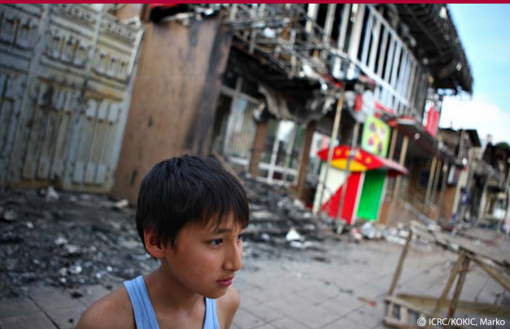
The devastated town of Osh