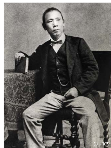
Tsunetami Sano, founder of the Japan Red Cross Society

Finally, the Edo government's national isolation policy ended and 30 years after opening up the country, in September 1887, JRCS began to work with the ICRC. Thereafter, Japan surprised the World by its careful treatment of prisoners of war during Japanese-Sino War and Japanese-Russo War.