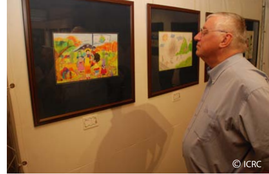
Visitors appreciate with the paintings drawn by Japanese and Iranian children at "Friendship and Peace" exhibition