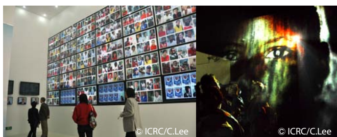
Bottom-right : Students staring at a screen made of fog