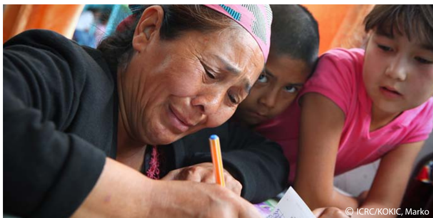
Bazarqurgan. A woman, whose brother is being held by the police, is writing a Red Cross message

The ICRC and volunteers from the Kyrgyz Red Crescent also distributed food rations in the city of Osh, and in the Osh province along the Kyrgyz-Uzbek border. Over 200,000 people have so far received rations of wheat flour and oil. Kitchen and hygiene items have also been distributed to 1,700