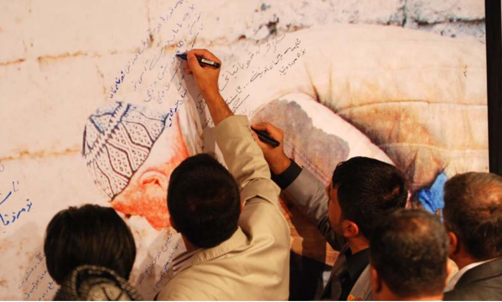
Visitors write their testimonies on a photo of Halabcha (Kurdish region of Northern Iraq)