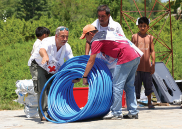
ICRC engineers set up a water point in a barangay in Mindanao. The ICRC works to help improve access to water in conflict-affected areas.

water and sanitation projects have been implemented in coordination with the local authorities.