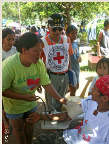
An ICRC nurse monitors the blood pressure of a displaced person. The ICRC, in cooperation with local authorities, has improved access to healthcare for thousands of displaced people and residents in Central Mindanao.