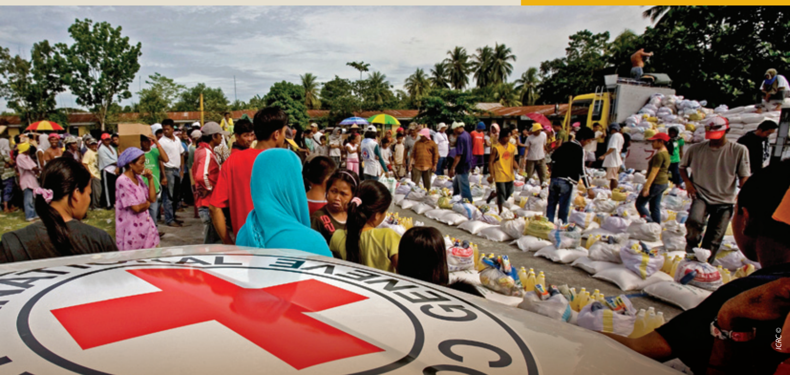
Displaced families gather to receive food at a distribution point in Mindanao. ICRC food distributions have benefited thousands of those who have been forced to flee the fighting in Central Mindanao.

The ICRC has also worked with the PNRC through various workshops and seminars aimed at boosting the latter's capabilities in providing psychosocial support during emergencies, first aid response in conflict and other situations of violence, water and sanitation, assessment, and in gaining safer access to conflict-affected areas. The ICRC also supports the PNRC in its continued efforts to disseminate Red Cross and IHL principles at the barangay-level, and provides training to upgrade the skills of its disseminators.