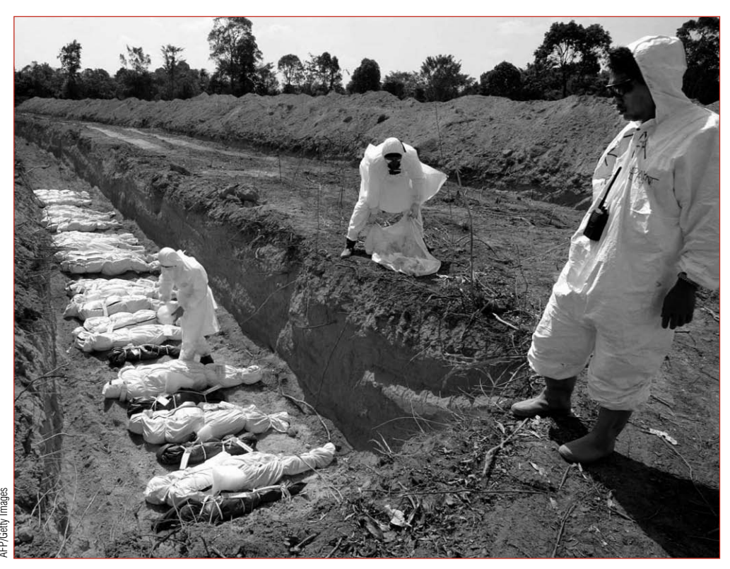
Temporary burial of dead bodies in Thailand following the tsunami disaster on 26 December 2004.