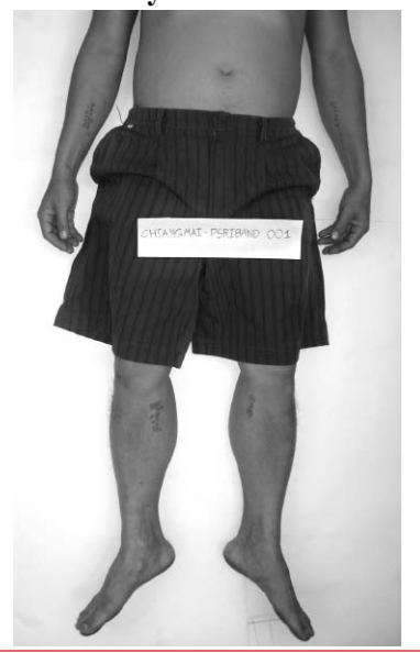
Note: For the purpose of demonstration, photographs were taken of a volunteer and not of a deceased individual.