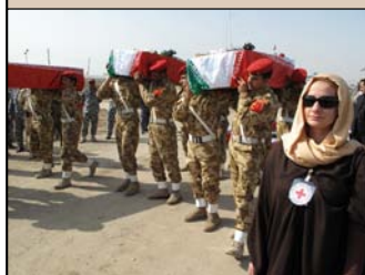
Repatriating the remains of soldiers who died in the Iran - Iraq war