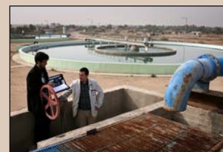
Running water and sanitation projects