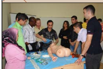
Training doctors and nurses in emergency services and trauma management