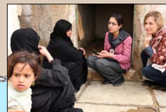
Supporting vulnerable groups