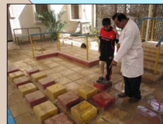
Supporting rehabilitation centres