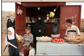
Conducting micro-economic projects for female-headed households