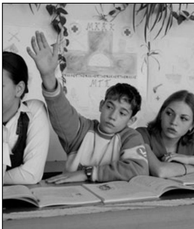
A young student participating in an IHL class at his Moscow school

programmes in key regions such as Moscow and the northern Caucasus and others which have shown particularly strong commitment.