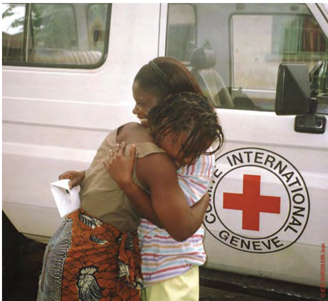
Gbarnga, family reunion under the aegis of the ICRC, June 2000.

Last April, the program was officially closed in the whole region. This was good news for Liberia and its neighboring countries, as it means that peace has now enabled families to communicate and be together without the help of the Red Cross.