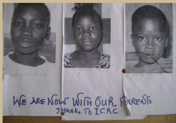
Banga, children who had to flee from their homes after their town was attacked have just been reunited with their families. February 2005.