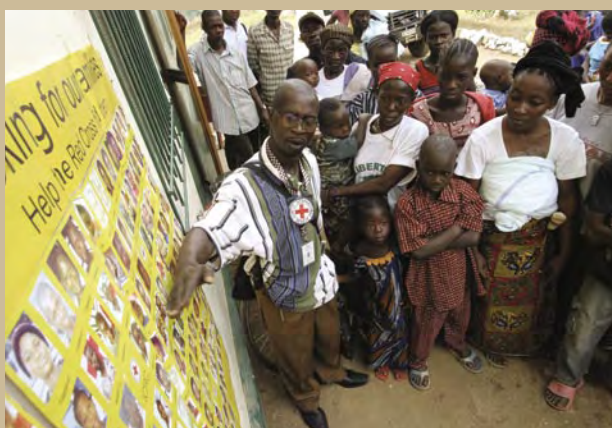
Lofa county, ICRC employee explaining the role of the tracing agency. March 2006.