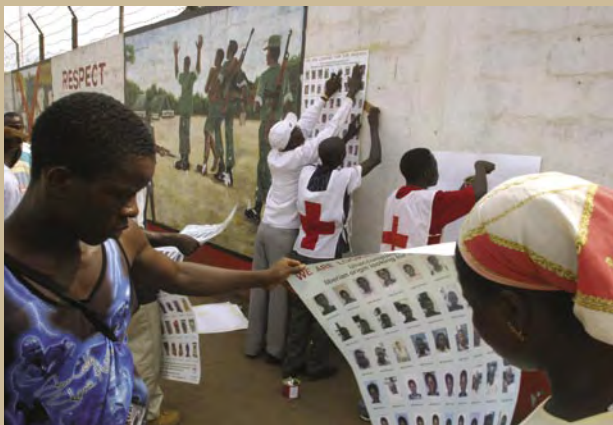
Monrovia, in front of the ICRC delegation. Hanging of posters by Liberia National Red Cross volunteers. December 2002.