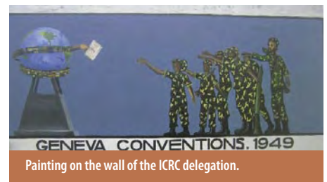
GENEVA CONVENTIONS. 1949 Painting on the wall of the ICRC delegation.

"We are building a new army and we are very exigent regarding its standards - we can only improve the knowledge we will transmit to the soldiers, so we all know exactly what is allowed and what is not," he further explained.