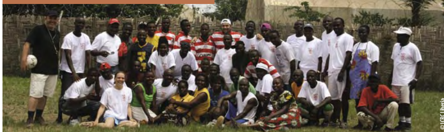
Congratulations to the team of Voinjama for their active support of 'Score for the Red Cross'! Monrovia is still warming up.