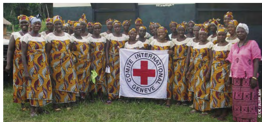
Graduation of the ICRC sponsored Training of Traditional Midwives program at Kpotomai, Lofa County, April 2008.

The ICRC continues to assist the Ministry of Health in prevention activities supporting routine and outreach vaccination and distribution of mosquito nets. Since last year, more than 18,500 mosquito nets have been distributed in the catchment areas of the ICRC supported health facilities.