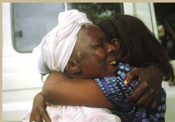
Ggarnga, family reunion under the aegis of the ICRC. June 2000.