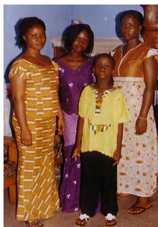
FOUR OF THE FIVE GIRLS (2009)