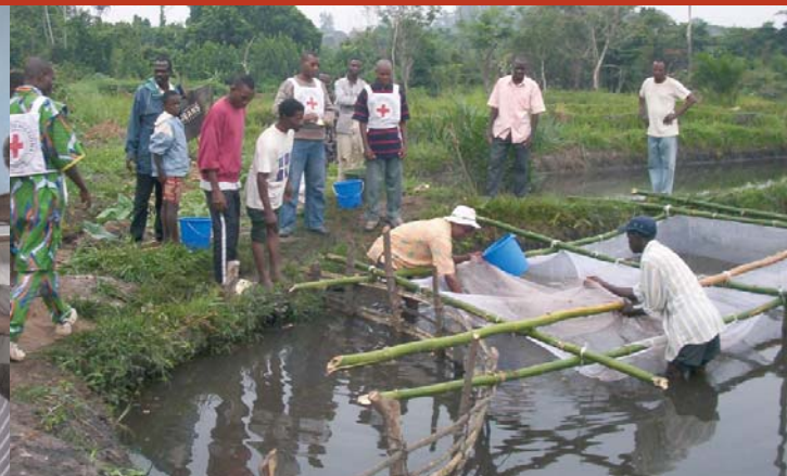
Ba nga bizinga bazungululu kwa bisadi bia CICR