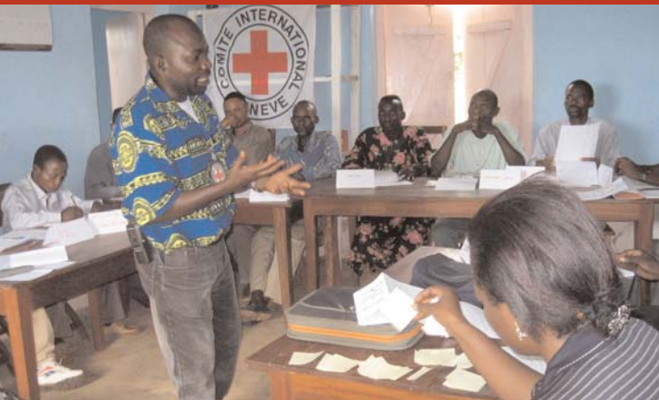
kimoko na milongi mia tukolo mu nkieno mia DIH