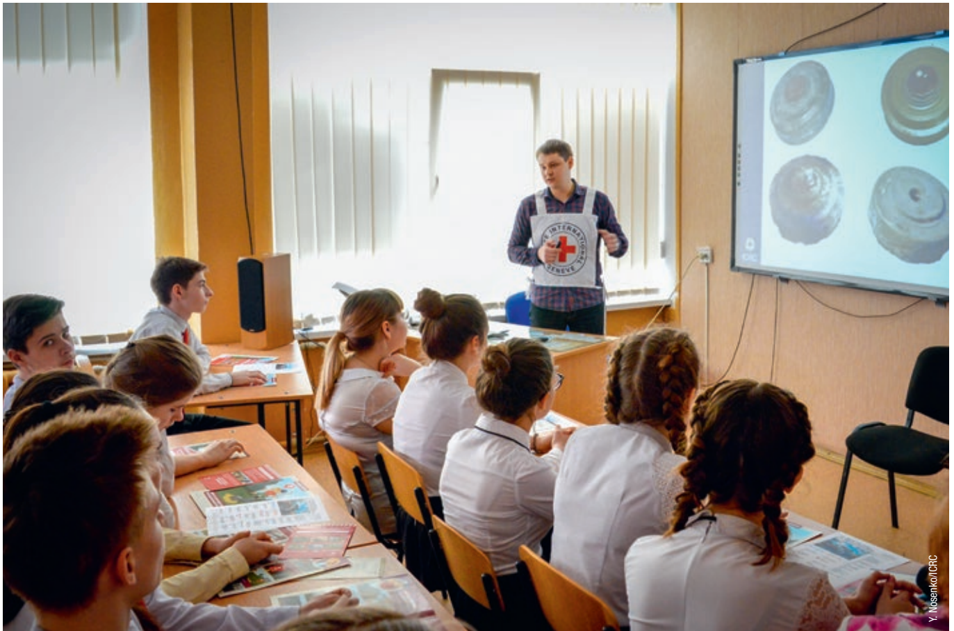
Ukraine, Donetsk region, Mariupol. At a public school, students learn more about safe behaviour around mines/explosive remnants of war at a mine-risk awareness briefing conducted by the ICRC.