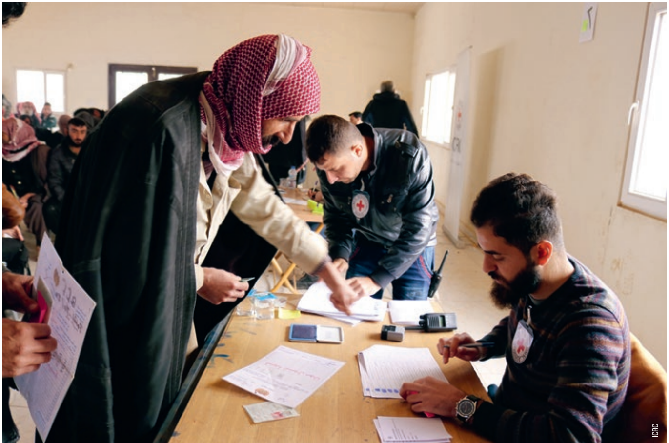
Iraq, Sinjar Mountains, IDP camp. Some 2,000 families coped with winter with the help of cash grants – for purchasing blankets and other essential supplies – from the ICRC.