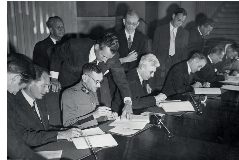
The Swiss delegation sign the Final Act of the Diplomatic Conference, Geneva 1949.

Over the years, there have been many instances in South Asia when the application of the Geneva Conventions has offered real protection to those caught between conflict.