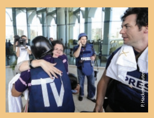
In August, the ICRC evacuated 33 journalists from the Rixos Hotel in Tripoli, Libya and led them to safety. The reporters had been unable to leave the hotel for several days. The ICRC's recognized role as a neutral intermediary enabled it to carry out this operation.

The media of East Asia, Southeast Asia and the Pacific have an important role to play in covering conflict and violence as well as the issues faced by vulnerable groups. At times, reporting on these situations put the media's own safety at risk. Bringing together senior representatives of media organizations from the region, a conference themed "Reporting on Violence and Emergencies" hosted by ICRC aims to advance discussion on best practices related to these topics. The event will also provide a forum to discuss how the media can be influential in limiting the humanitarian consequences of violence and emergencies.