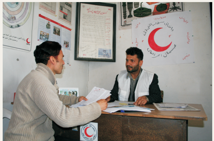
ICRC and ARCS staff coordinate the distribution of Red Cross Messages, Mazar-i-Sharif