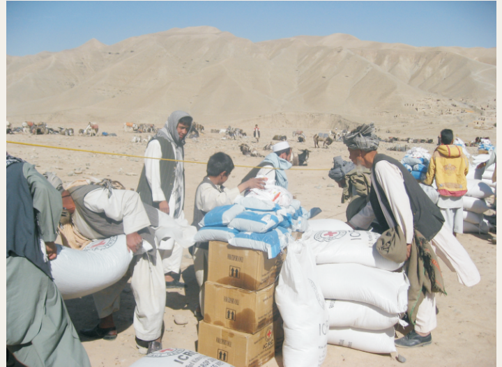
Food distribution for drought-affected families, Kunduz

Working in cooperation with the ARCS, the ICRC provided food and non-food items to 192 destitute and displaced families in Baghlan and Kunduz provinces.