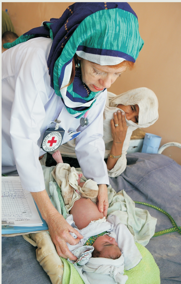
22 ICRC expatriates support Mirwais hospital staff in Kandahar