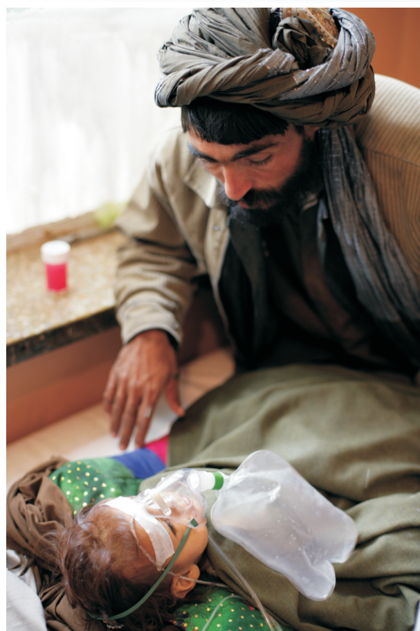
Father and child patient, Mirwais Hospital, Kandahar