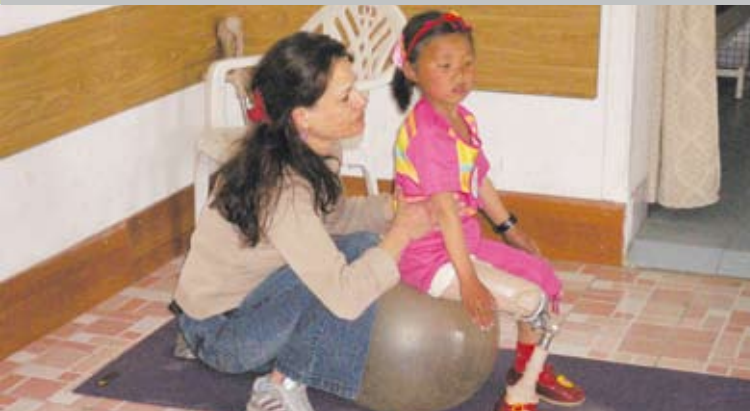
Physiotherapy treatment provided at the Songrim Physical Rehabilitation Centre in the DPRK.

The ICRC works with National Red Cross Societies to strengthen their capacity to reunite family members, separated as a result of armed conflict or other disasters. It continues to impress upon both the governments and the National Societies of the Korean peninsula the importance of finding a solution to the longstanding anguish endured by families separated as a result of the Korean war.