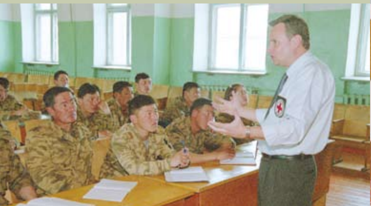
An ICRC delegate discusses questions about the ICRC's work with members of the Mongolian Armed Forces.

As the guardian of the Movement's Fundamental Principles, the ICRC maintains a dialogue with its Movement partners on the evolving humanitarian environment.