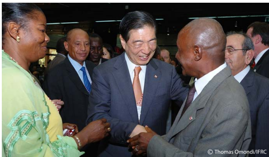
Representatives of National Societies congratulated newly elected IFRC President, Mr. Tadateru Konoe, on his victory: General Assembly of the IFRC in Nairobi, November 19

Mr. Konoe was born on May 8, same date of birth as Henry Dunant (the founder of the Red Cross), in 1939. He graduated from the Gakushuin University in Tokyo, and furthered his studies in International Relations at the London School of Economics. He joined the JRCS in 1964 and worked in Geneva for 8 years. In 2005, Mr. Konoe became the President of the JRCS and the Vice President of the IFRC.