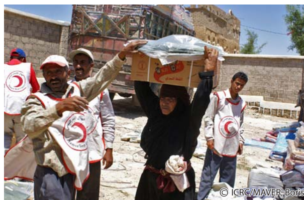
Non food items distribution by the ICRC, supported by the Yemen Red Crescent Society, to IDPs: September, 2009

humanitarian organisations as well as donors to look beyond the camps, and urges for further respect for IHL as a means to prevent displacement and protect IDPs.