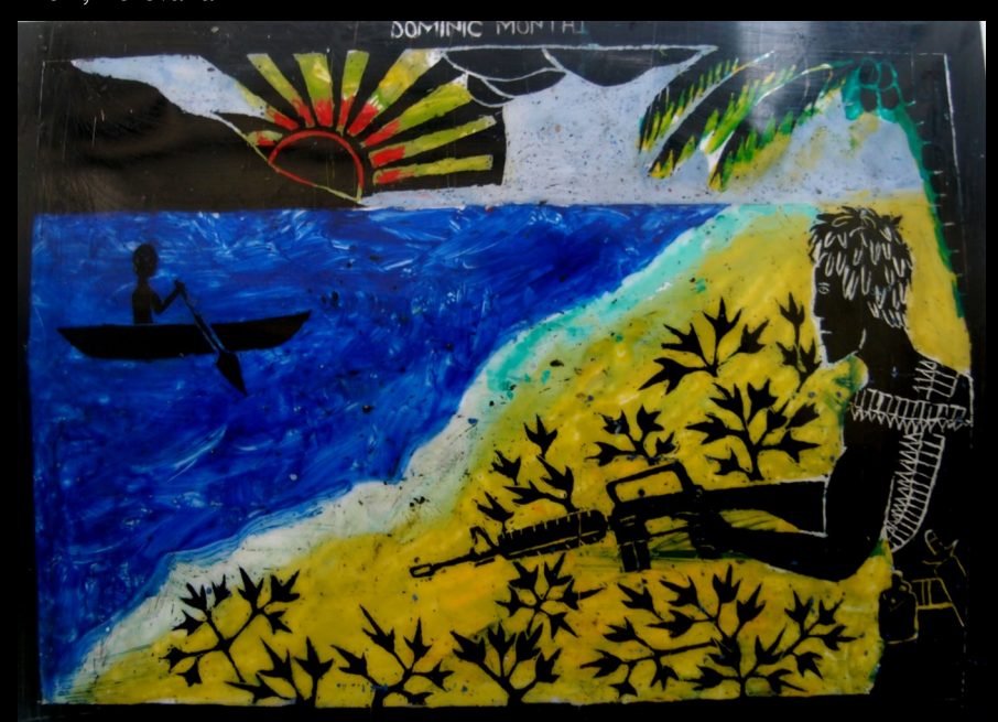
Dominic Montai, Buin Front cover: Chernz, Gagan