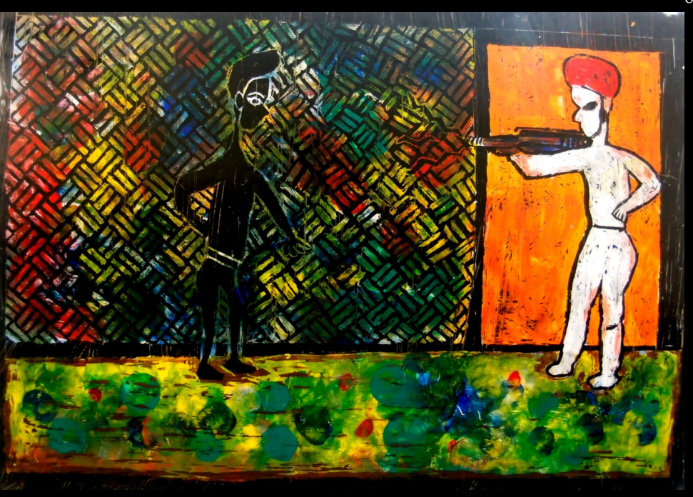
Anonymous, Buka Town