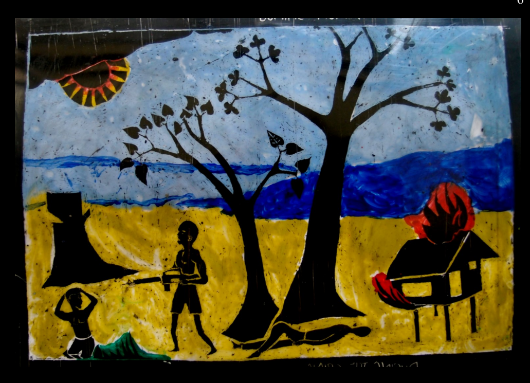
Dominic Montai, Buin