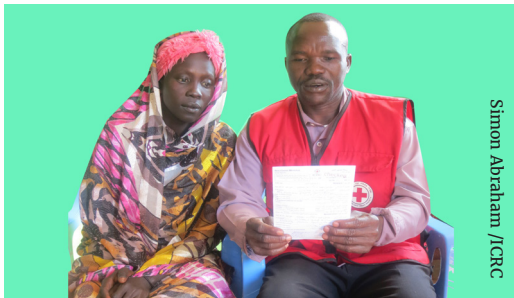
Red Cross social worker reading a letter (Red Cross Message) to a South Sudanese refugee which was sent by recently traced sister, at a refugee camp in west Ethiopia, 2019.

The ICRC, in cooperation with the ERCS, strives to restore family links between family members separated by conflict, violence and migration through the tracing services of the Red Cross and Red Crescent Movement as well as through the provision of free phone calls and the exchange of Red Cross Messages (RCMs).