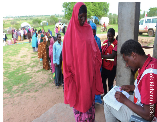
People affected by ethnic violence getting registered to receive cash assistance (from Red Cross) aimed at restoring their livelihood, Moyale town, 2019.