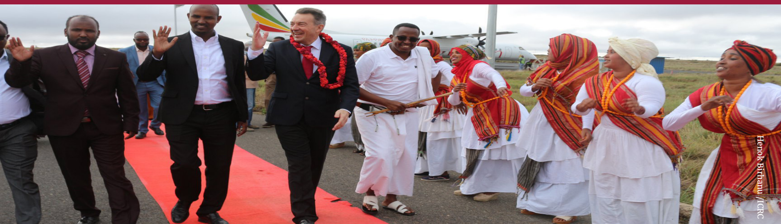
ICRC President, Peter Maurer, accorded warm welcome up on his arrival at Jigjiga airport as part of his visit to Ethiopia.

The ICRC is present in Ethiopia since the beginning of the 1977 Ethio-Somalia armed conflict. Its current main activities in the country are: addressing the humanitarian needs of the people affected by conflict and violence through an integrated multi-disciplinary response, and reinforced protection dialogue with weapon bearers, visiting places of detention so as to ensure both the treatment and conditions of detainees are matching international standards. Helping people with physical disabilities (PWDs) get access to quality and sustainable physical rehabilitation services. It also works closely with the Ethiopian Red Cross Society (ERCS) to restore family links among people separated by armed conflict and other situations of violence and provides assistance mainly to people displaced by ethnic conflict. The ICRC also promotes the knowledge of International Humanitarian Law (IHL) among members of defense and police forces as well as higher learning institutions, legal professionals and policy makers.