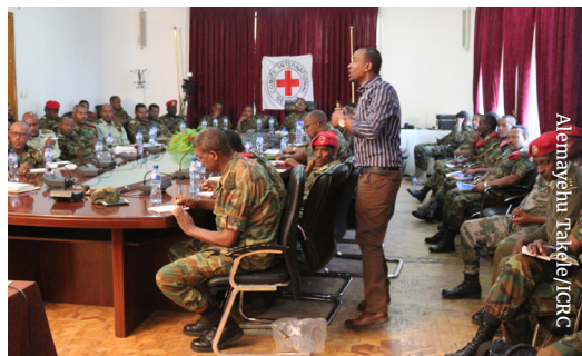
Special Operation Force of ENDF officers participate at a seminar organized by the ICRC to discuss IHL, in partnership with the Ethiopian National Defense Forces, Addis Ababa, 2019.

The ICRC promotes the knowledge of International Humanitarian Law (IHL) and International Human Rights Law (IHRL) amongst various interlocutors such as military and police forces, national authorities, and academic circles and supports efforts to domesticate IHL and IHRL.