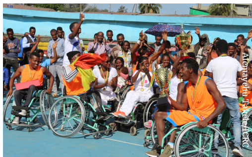
Winners of 5th National Wheelchair Basketball Tournament conducted with support of the ICRC celebrating their triumph, Addis Ababa, 2019.

The ICRC Physical Rehabilitation Program aims at promoting equal access to quality and long-term sustainable rehabilitation services to Persons with Physical Disabilities (PWDs) through support to national and regional actors to enable them recover mobility, play an active role in society and live in dignity.