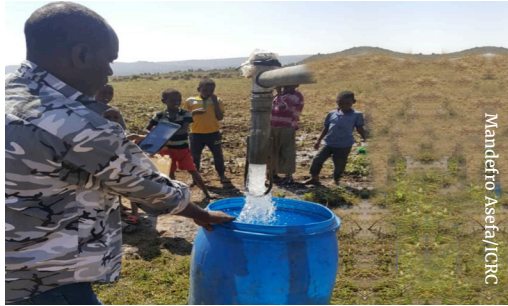
Returnees fetching water from water point built in Tuluguled town, East Hararghe Zone by ICRC, 2019.

The ICRC works with local authorities and communities to improve access to clean water and sanitation services.