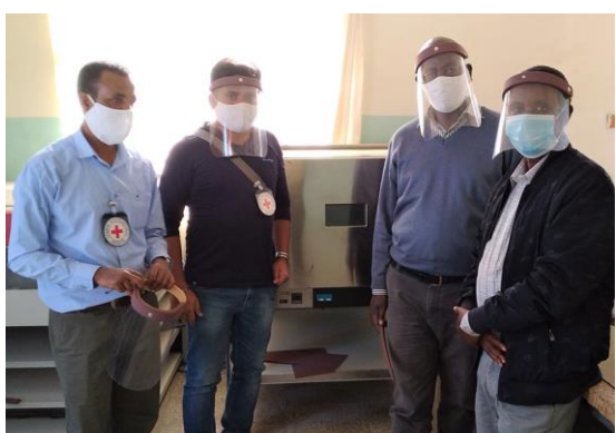
Ethiopia: samples of face shields produced by Dessie Physical Rehabilitation Center with the support of ICRC. Dessie, Amhara Region, 2020