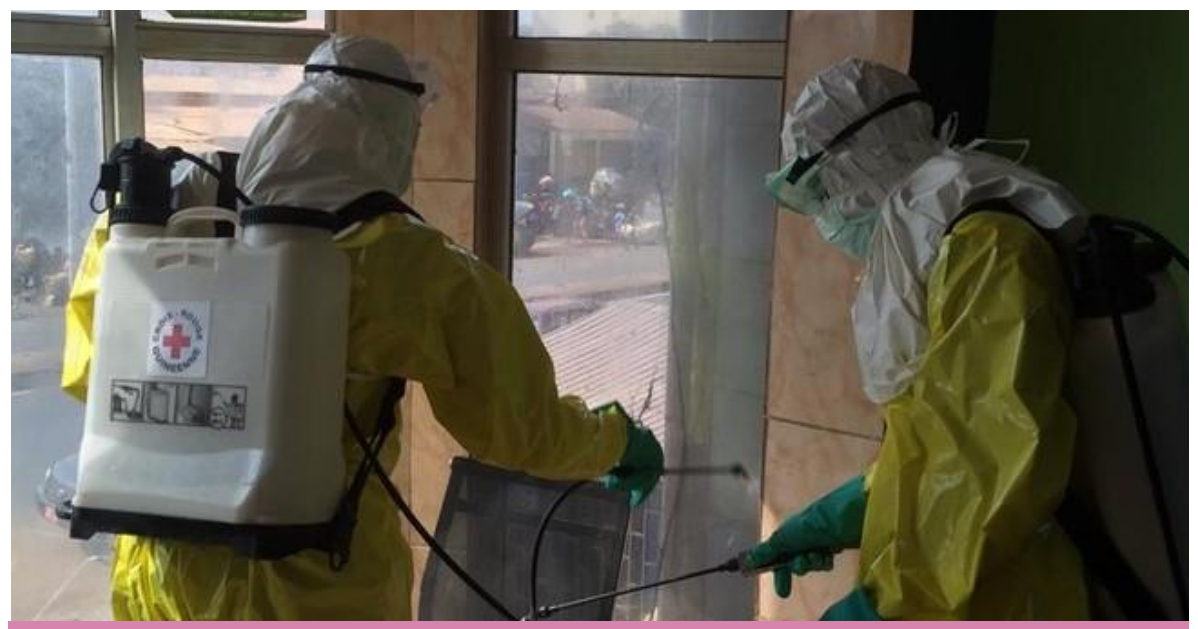
Guinean Red Cross volunteers disinfect premises in Conakry as part of the fight against Covid-19

"We believe the fight against COVID-19 and the continued effort to provide assistance and protection to people caught up in conflict are complementary and mutually reinforcing. We are focusing our COVID-19 responses on conflict areas and locations inaccessible to other actors, focusing mainly on vulnerable populations IDPs, detainees, migrants »