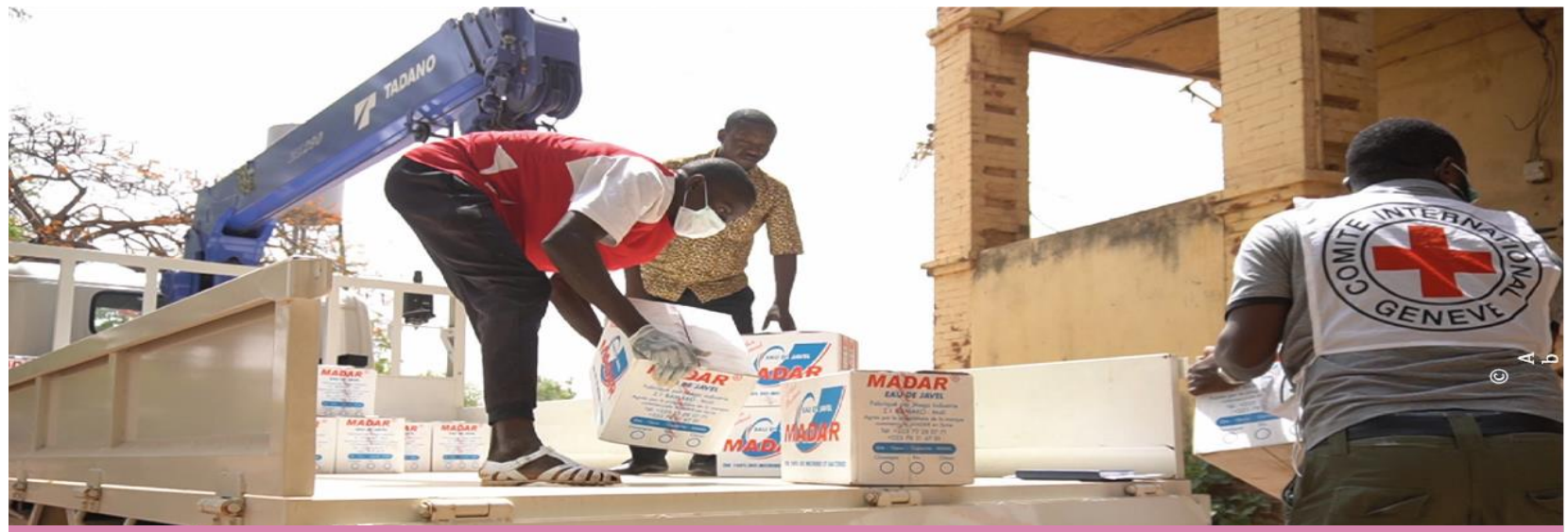
Mali: delivery of hygiene and medical items to University Hospital Center (CHU) in Bamako