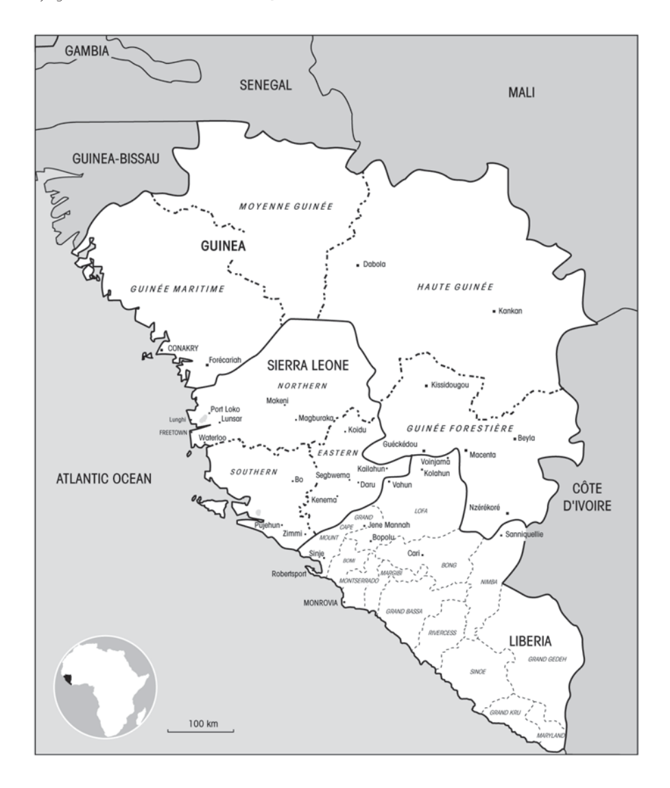
[N.B.: This case study was written by Thomas de Saint Maurice in view of its publication in the 2001 French edition of this book. It is based exclusively on documents available to the public, such as press releases, reports by agencies or United Nations documents.]

[Country names and borders on this map are intended to facilitate reference and have no political significance.]