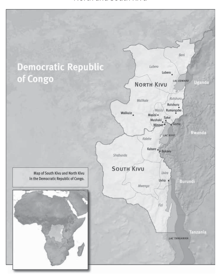
Maps North and South Kivu