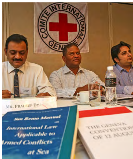
High-ranking officers from 15 Asia-Pacific countries attended the regional seminar on the law of armed conflict at sea in Thailand.

Where possible, the ICRC makes similar approaches to other weapon bearers, in particular armed groups fighting the authorities.