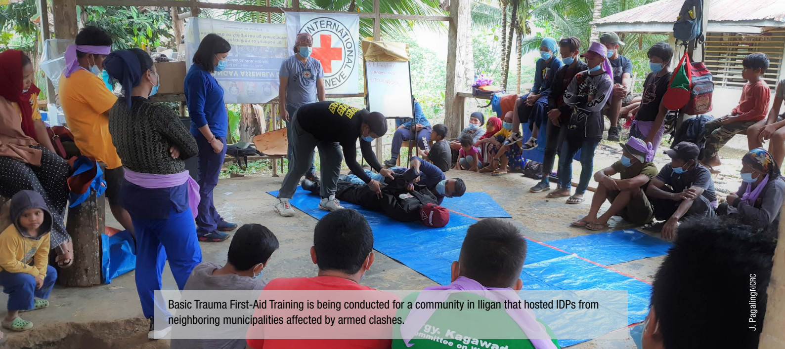
Basic Trauma First-Aid Training is being conducted for a community in Iligan that hosted IDPs from neighboring municipalities affected by armed clashes.