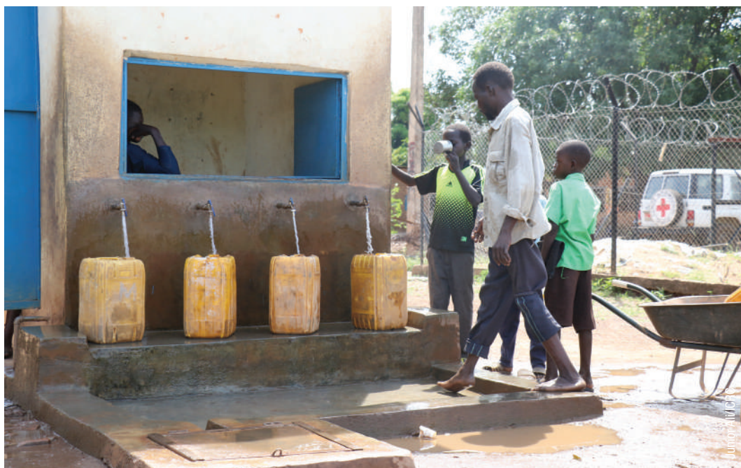
A water kiosk at one of the ICRC solar powered water points in Wau.

Continued to progress on improving urban water supply services through the Juba Urban Water Supply Project which will benefit over 110,000 people.