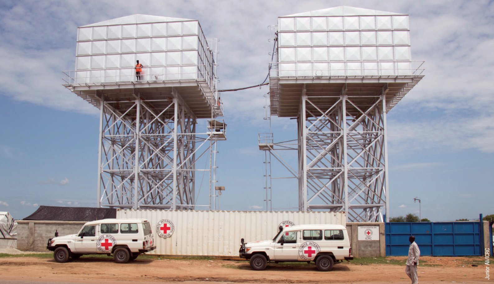
The elevated tanks of the Juba Urban Water Supply Project at Gumbo, near Juba, which the ICRC is constructing to help increase access to water in Juba for over 110,000 people.