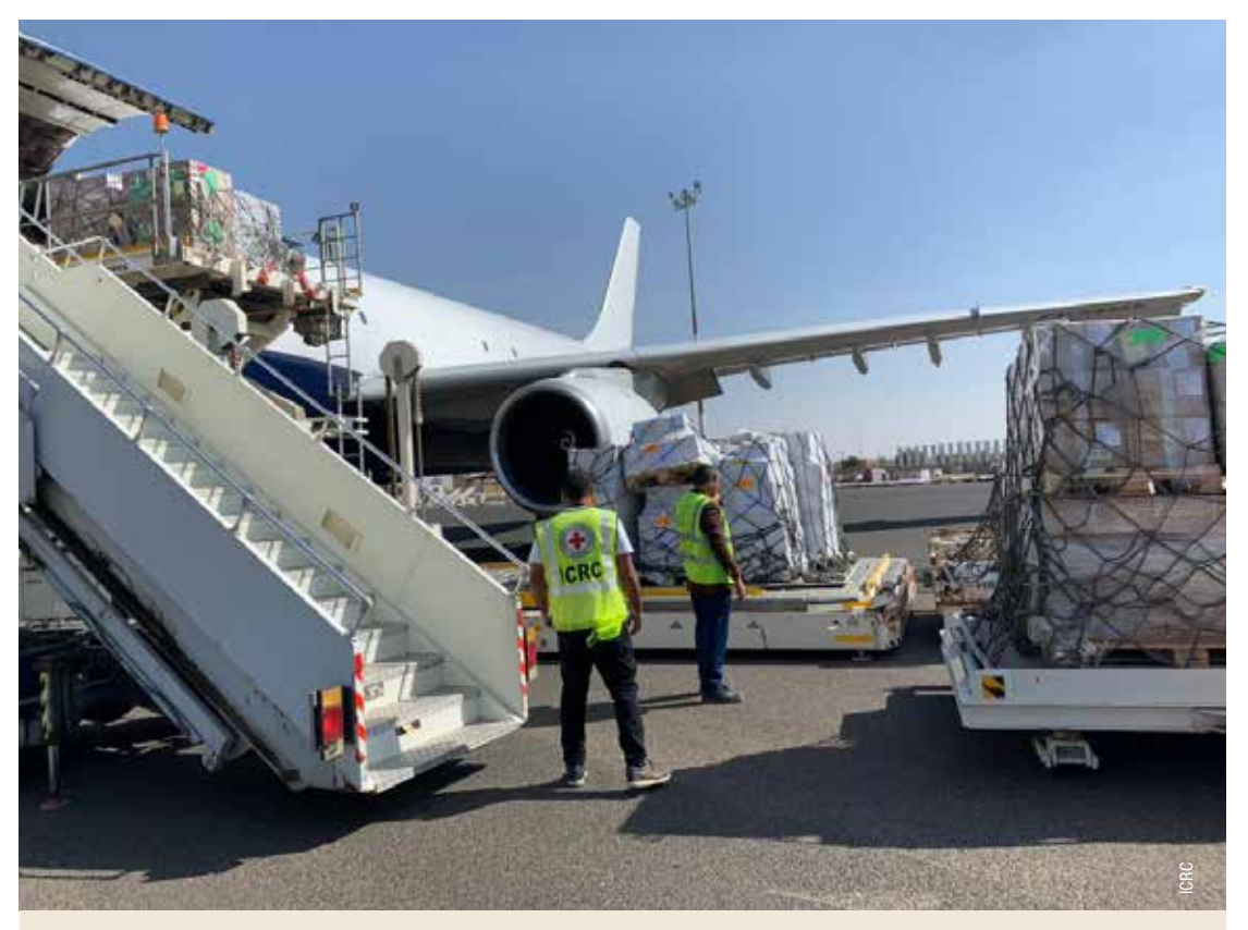
An ICRC medical shipment brought to the country by air.

were performed in all hospitals supported by the ICRC.