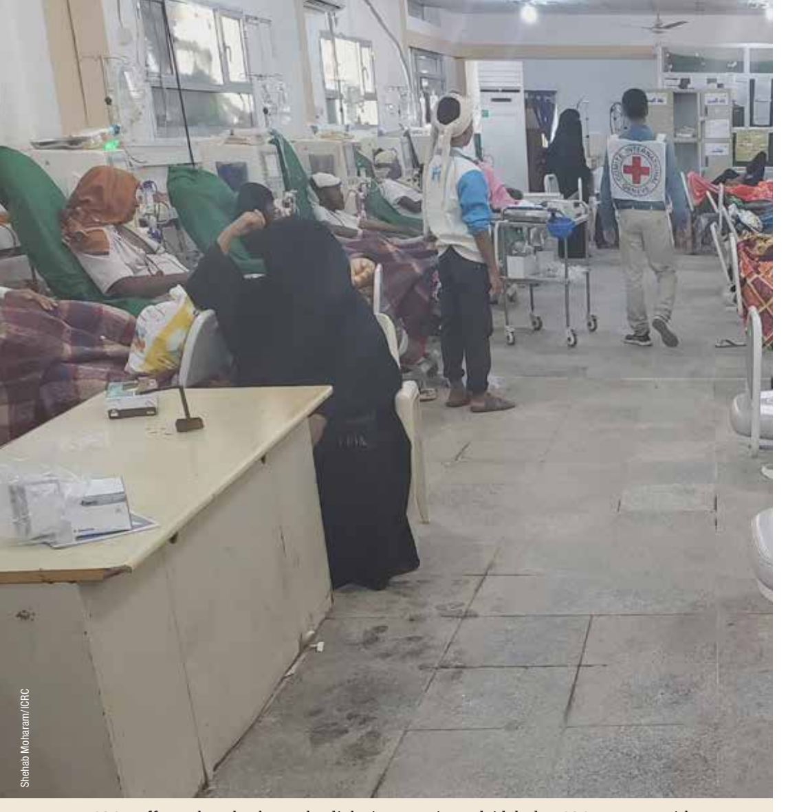
An ICRC staff member checks on the dialysis center in Hodeidah the ICRC supports with medical supplies.