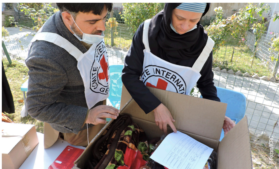
An ICRC team in Afghanistan packs hygiene and winter items to be distributed among detainees in a prison.

The ICRC started direct purchase of relief supplies from China in 2010 and the country quickly emerged as one of its largest procurement hubs worldwide. Items purchased include a wide variety of goods such as kitchen sets, agricultural and fishing tools and medical equipment. They are distributed to communities affected by conflict in countries such as Afghanistan, Ethiopia, Nigeria, South Sudan, Syria and Yemen.