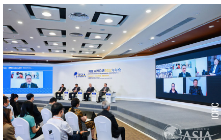
Head of ICRC Regional Delegation for East Asia (on left screen) participated in Boao's sub-forum "Economic Development and Security" in 2022.

As part of our engagement with the private sector, we provide guidance and share best practices with companies operating in fragile environments to help them fulfil their corporate social responsibility duties. The ICRC has addressed expert-level audiences at prominent forums, including the Boao Forum for Asia, on issues around the humanitarian–development nexus, global health and responsible business in fragile contexts.