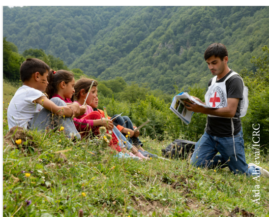
ICRC employee is raising awareness on the risks of mines and unexploded ordinances, and safer behaviour.

114 representatives from various national entities involved in efforts to clarify fate and whereabouts of missing persons benefitted from various trainings organized by the ICRC.