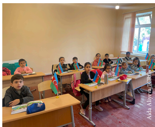
More than 1,800 students have benefitted from rehabilitation of schools through the ICRC support.