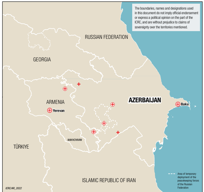
🕀 ICRC delegation 🕂 ICRC sub-delegation 🔶 ICRC mission 🛛 🕂 ICRC presence