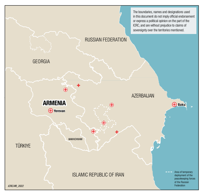
🛞 ICRC delegation ICRC sub-delegation 🔶 ICRC mission 🕂 ICRC presence