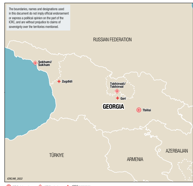
🕀 ICRC delegation 🔶 ICRC mission 🕂 ICRC presence