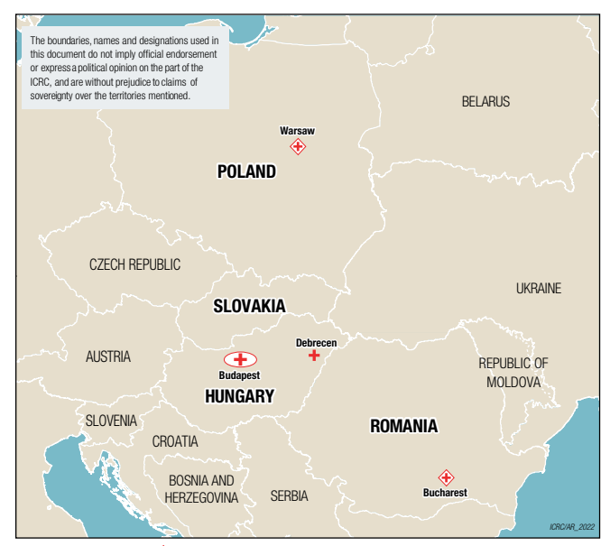
(+) ICRC regional delegation (+) ICRC mission (+) ICRC office/presence