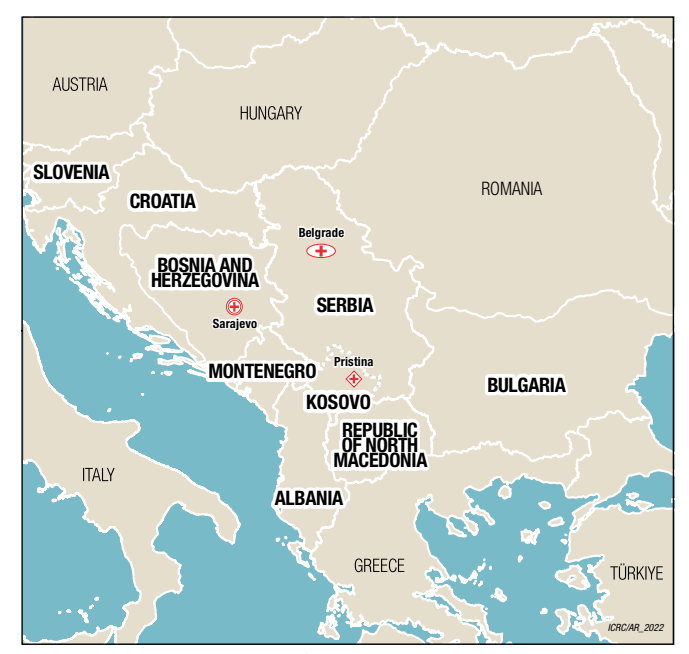
\pm ICRC regional delegation 🛛 🕀 ICRC delegation 🔶 ICRC missio