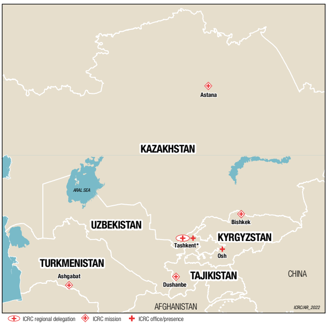
ICRC mission poorting ICRC operat ICRC regional delegation *Map shows structures support