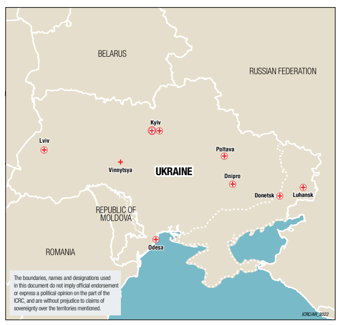
(+ ICRC delegation + ICRC sub-delegation + ICRC office/presence