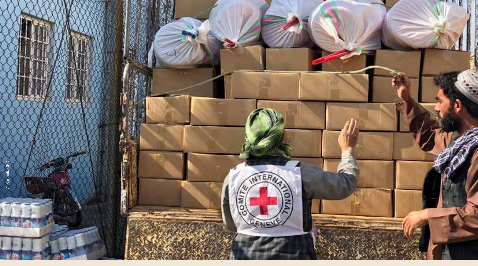
Hygiene products and winter items such as blankets being distributed at Herat Provincial Prison.