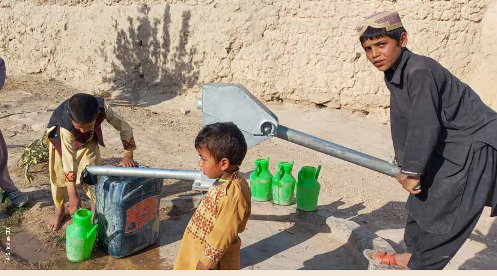
A hand pump repaired by the ICRC to provide safe drinking water to Khurmaleq community in Farah.