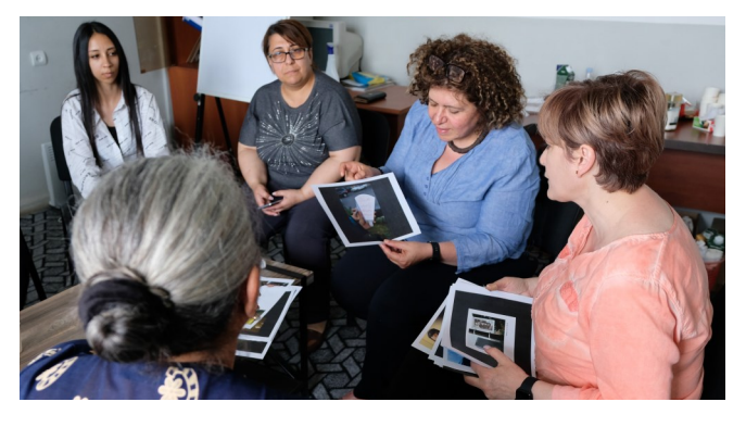
An MHPSS group session for the families of the missing in Armavir region, Armenia.

96 persons including 35 mental health practitioners and health professionals from partner NGOs and Armenia's Ministry of Defense (MoD), who attended a three-day training on MHPSS Response to persons previously detained, organized jointly by the ICRC and the Swedish Red Cross in Yerevan, were trained to be able to provide MHPSS and to enhance their interaction skills with the families of missing persons, people previously detained and those affected by violence.