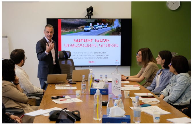
Media workshop for the local journalists at the ICRC office n Yerevan.

13 editors-in-chief of the key media in Armenia 24 officers and non-commission officers of the Border participated in the closed briefing chaired by the humanitarian issues in the region.