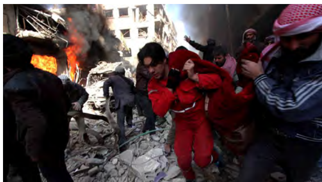
February 2015, SARC first aid teams in Douma Emergency Response providing first aid and health care services after shelling on the city that day