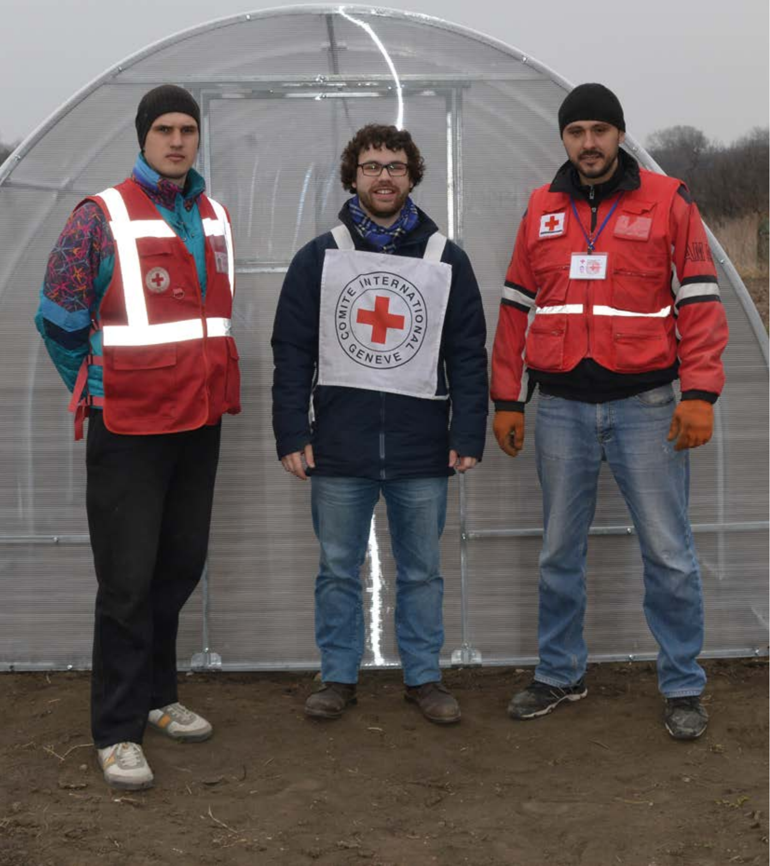
Lugansk province, Krymske, Ukraine. ICRC staff and Ukrainian Red Cross Society volunteers install a greenhouse for local residents in the framework of a joint project.