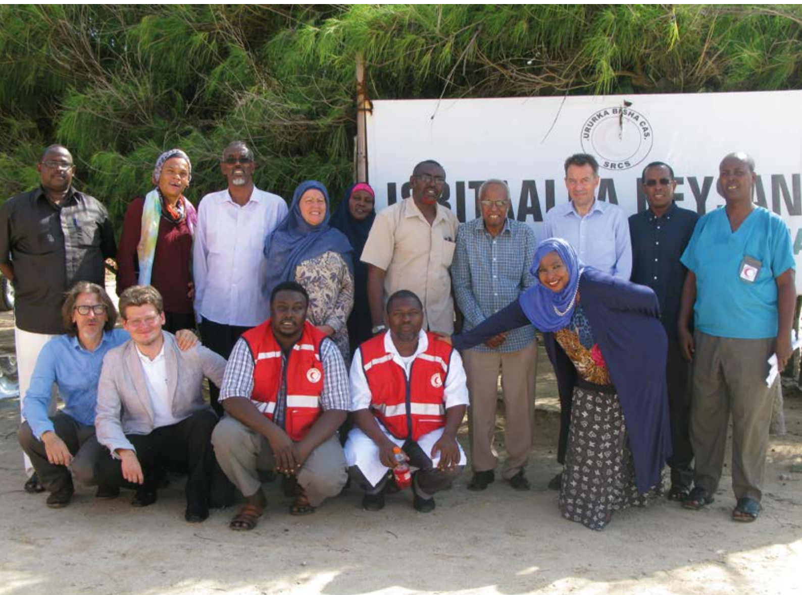
The ICRC President pays a visit to the hospital during his maiden tour of Somalia. The Keysaney hospital marks its 23rd year this year and remains one of the key hospitals supported by the ICRC in Somalia.