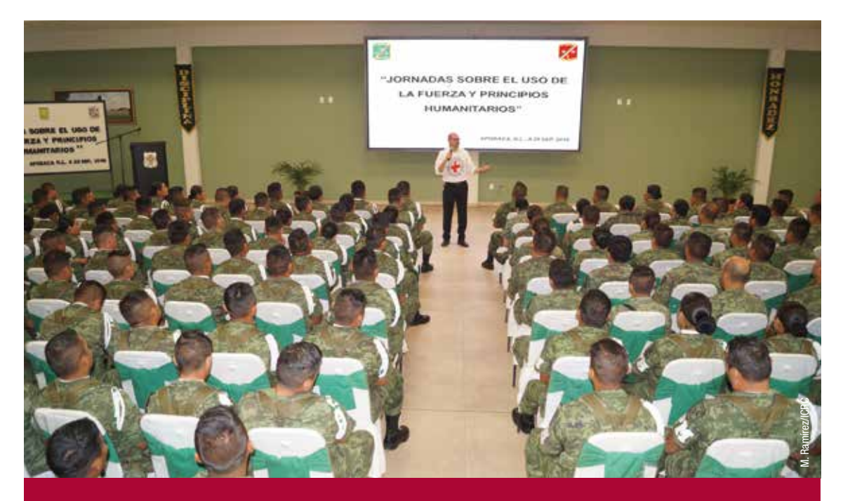
Mexico. Workshop on the use of force and humanitarian principles with armed forces personnel.