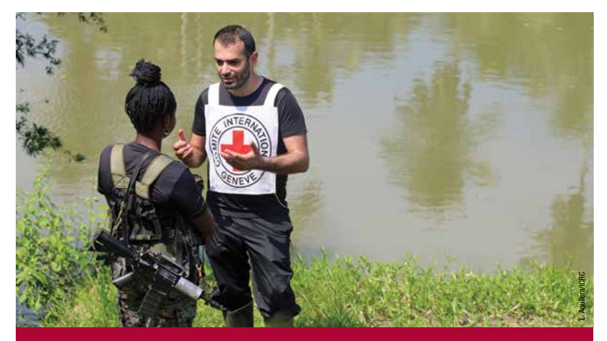
2017, Colombia. A Delegate from the ICRC talks to a member of an armed group.

The main instruments concerning the protection of people and property against armed conflict are the following (the abbreviations in parentheses are the ones used in the table below).