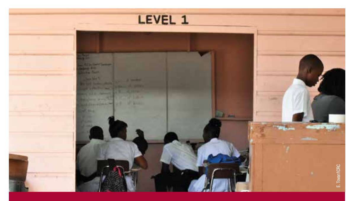
2017, Jamaica. Clarendon, school of transformation. A Jamaica Red Cross school, supported by the ICRC, offers different courses, sporting activities and professional training for the youth.