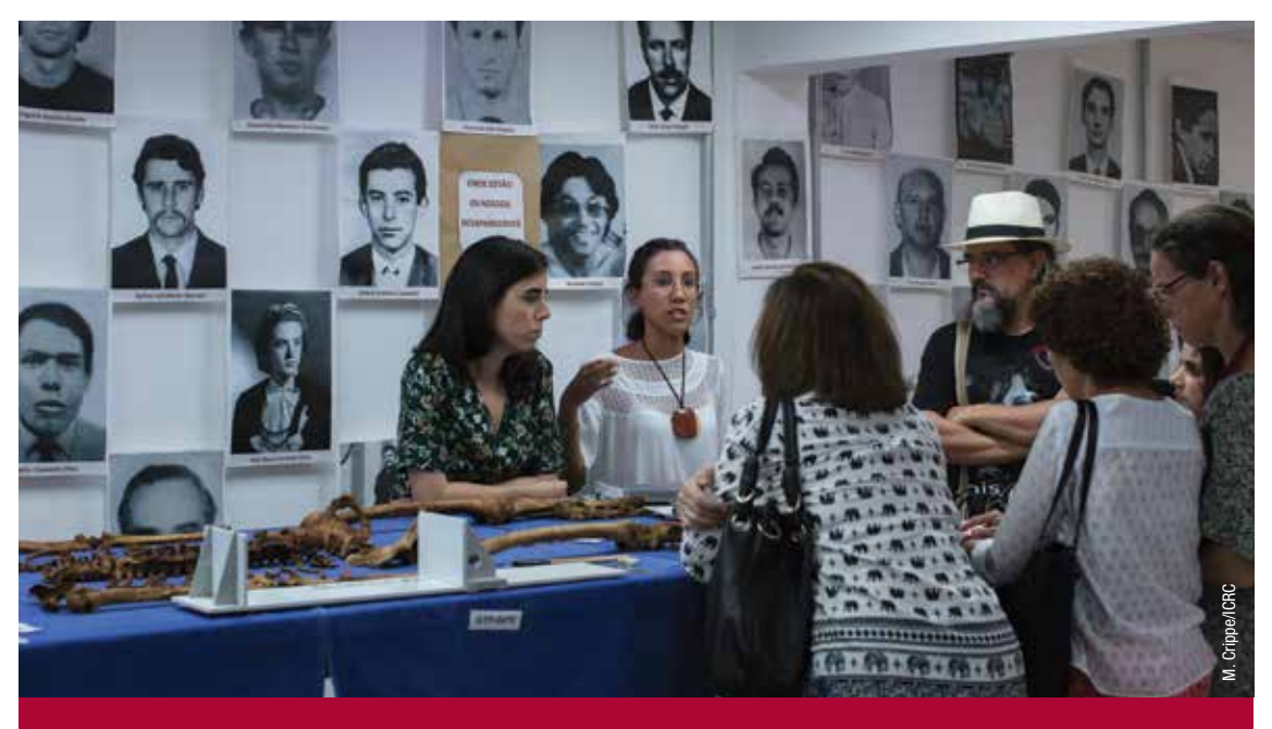
2017, Brazil. Anthropological and archaeological forensics centre at the federal university. The relatives of missing persons speak with members of the scientific committee of the Perus working group.

During the two-year period covered by this report, the OAS and its Member States continued and strengthened their efforts to develop and increase respect for IHL, which were mainly focused on two areas: promotion and training.