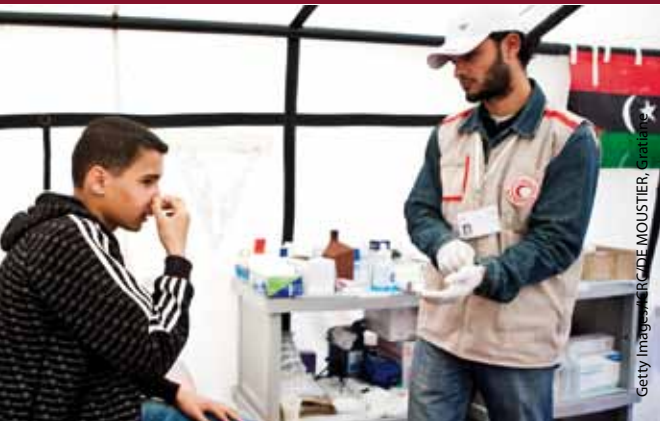
Benghazi, Al Hurria (Liberty) Square. A volunteer from the Libyan Red Crescent tends to a young patient.

Violent incidents erupted in Libya at the end of February 2011 and the situation deteriorated into a full-blown armed conflict in March. The ICRC immediately dispatched medical teams and surgical equipment to towns in the eastern part of the country affected by the fighting. It sent its first delegates to Benghazi on 26 February. In mid-April, it also opened an office in Tripoli to expand its operations in the western part of the country. From the evacuation of civilians stuck in the town of Misrata to assistance offered to displaced persons, visits to detainees or support for health-care services, ICRC delegates were present on all fronts.