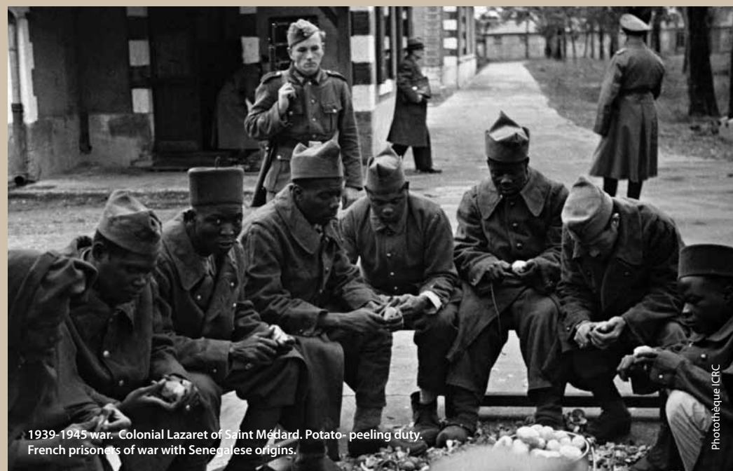
1939-1945 war. Colonial Lazaret of Saint Médard. Potato-peeling duty. French prisoners of war with Senegalese origins.