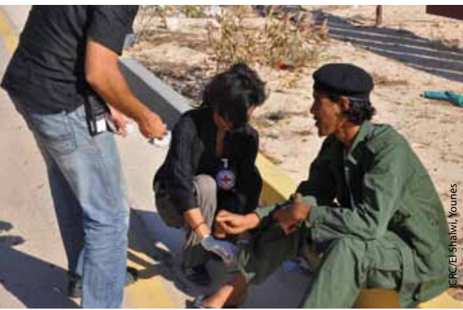
Brega. Members of the ICRC give first aid to a soldier injured by a bullet.