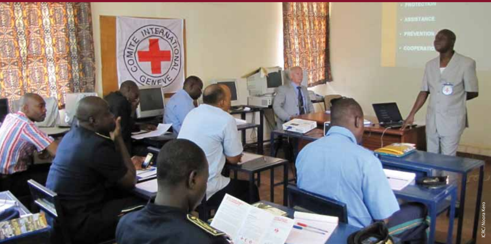
Police training session on the principles of international humanitarian law.