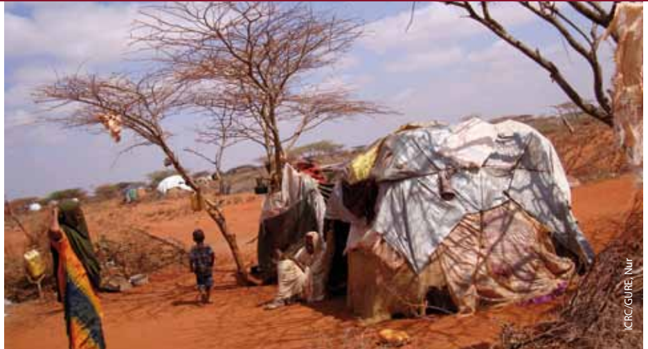
Galgadud Province, Cabudwaaq. Food distribution to internally displaced people. Tent sheltering a family. Wild animals are kept at a distance by bushes.

Since the beginning of the year, over 4,000 war-wounded patients have been treated in ICRC-supported medical facilities in Somalia.