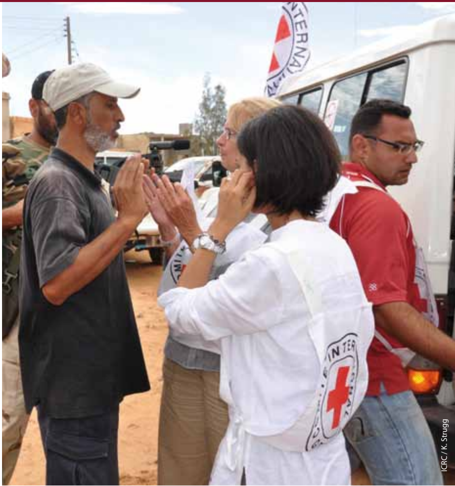
Members of the ICRC discussing on the front line with military commanders the organisation of evacuations to a field hospital.