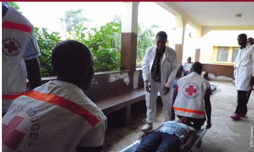
Emergency plan simulation exercise at the national hospital of Donka.

The International Committee of the Red Cross (ICRC) has since 2008 been providing support to Donka national hospital at the University teaching hospital (CHU) of Conakry to enhance provision of care to victims of violence. The emergency plan established in 2008 was implemented, with the help of the Guinean Red Cross Society (GRCS), during the September 2009 crisis in the capital. The plan has since been revised and a tabletop exercise was conducted in June 2011 with the participation of 160 GRCS volunteers.