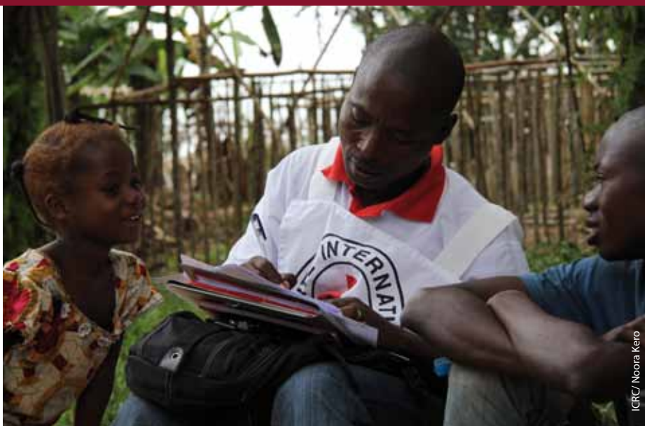
A Red Cross volunteer recording the needs of refugee populations.