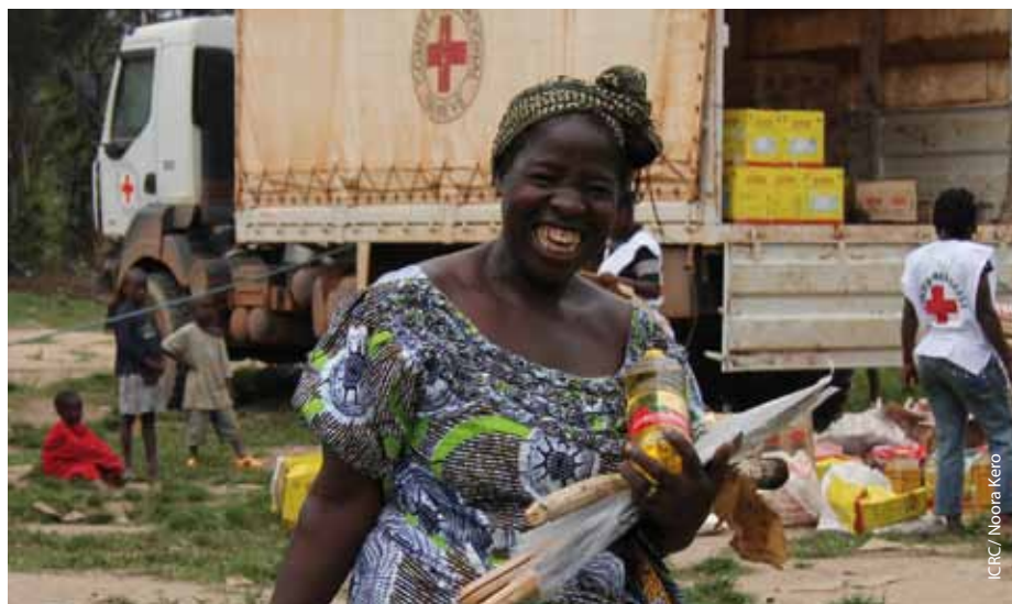
Rice, oil and salt distributed to Liberian farmers hosting refugees will help people survive the fallow season. Janzon Town, Grand Gedeh County.