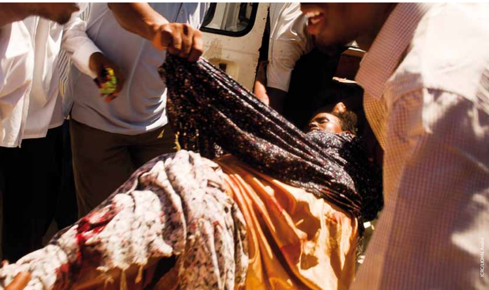
Mogadishu, Medina hospital, supported by the ICRC. Doctors receive a new patient, one of the numerous civilians affected by stray bullets.