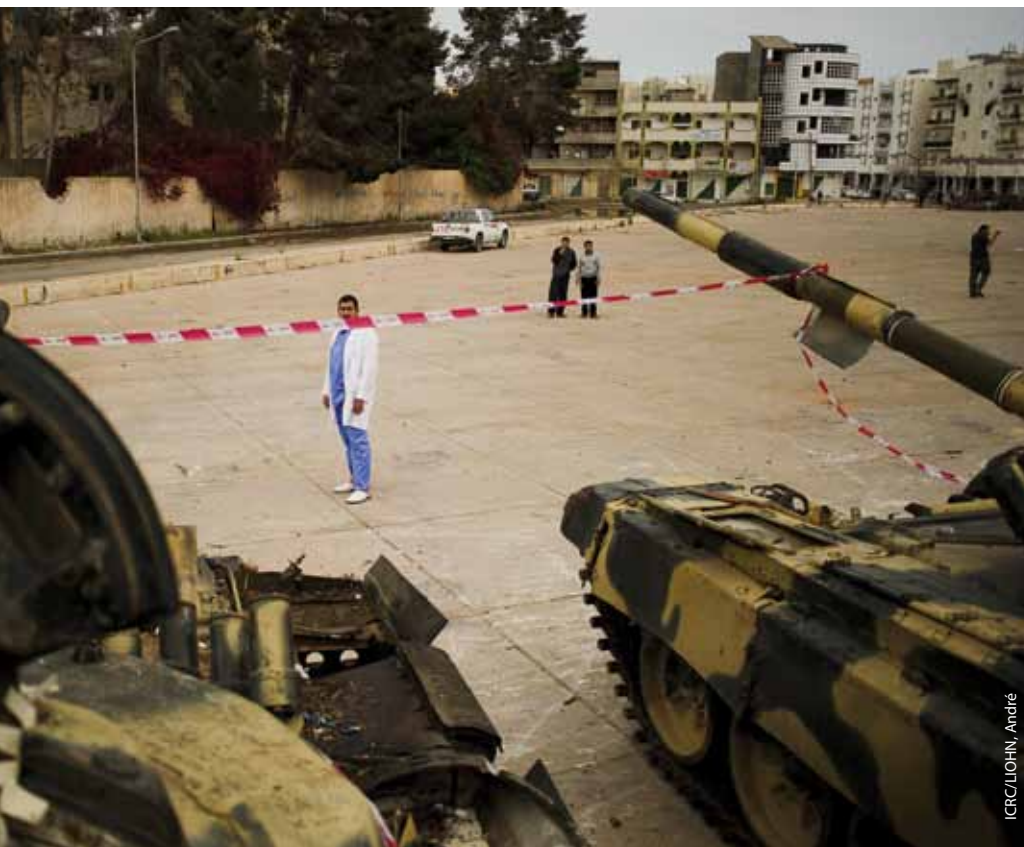
Front line of Misrata. A doctor looks for patients to be evacuated.