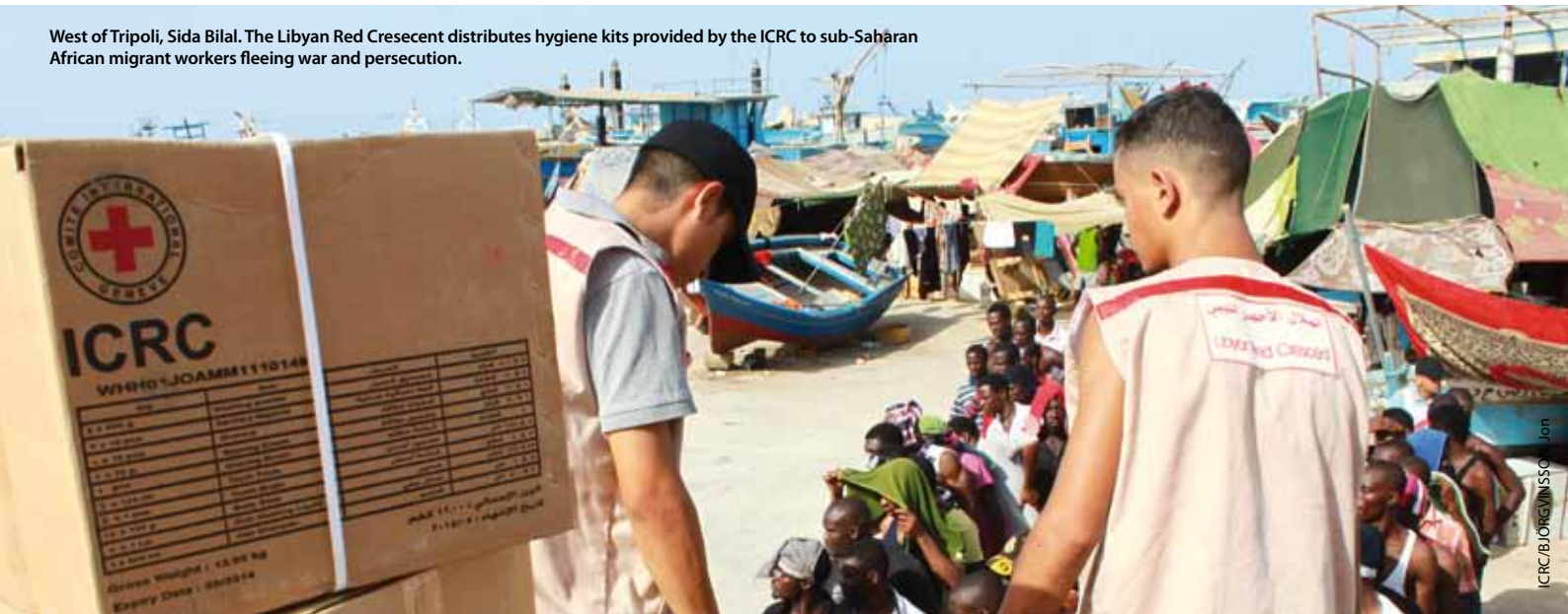
West of Tripoli, Sida Bilal. The Libyan Red Crescent distributes hygiene kits provided by the ICRC to sub-Saharan African migrant workers fleeing war and persecution.