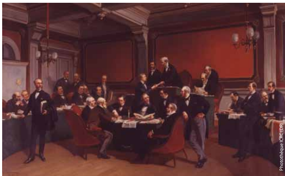
Signing of the Geneva Convention, 22 August 1864. (painting by Armand-Dumaresq)

Does the law governing non-international armed conflicts (NIACs) sufficiently address humanitarian issues that could arise from this type of conflict? International armed conflicts (IACs) are certainly more regulated than non-international armed conflicts. The vulnerability of the framework applicable to this type of conflict is a consequence of the sovereignist claims of States with regards to their internal affairs. As with the more general issue of the relevance or not of international humanitarian law (IHL) to contemporary armed conflicts, the International Committee of the Red Cross (ICRC) shares this concern.