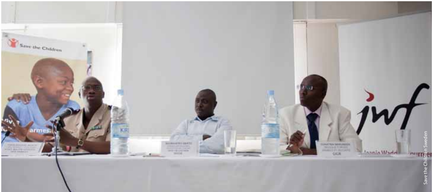
Representatives of the Senegalese army, Save the Children and the International Committee of the Red Cross at the conference.

On 22 September, at the ICRC Dakar Espace Jeanie-Waddell Fournier for humanitarian action and law, the publication 'Behind the Uniform: training the military in child rights and child protection in Africa' edited by Save the Children Sweden was launched. The event, co-organised by Save the Children, ICRC and the Office of the Chief of Defence Staff of the Senegalese Armed Forces, was attended by embassies, international organisations, NGOs and several civil and military authorities.