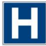
3. Hospitals white capital "H" on a blue background