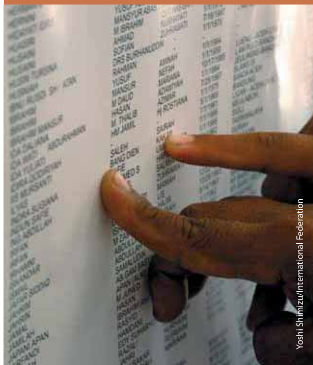
Yoshi Shimizu/International Federation