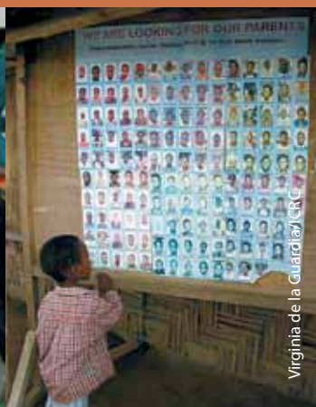
Virginia de la Guardia/ICRC