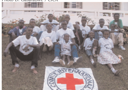
Children repatriated from Brazzaville arrive in Kigali. 17.07.03