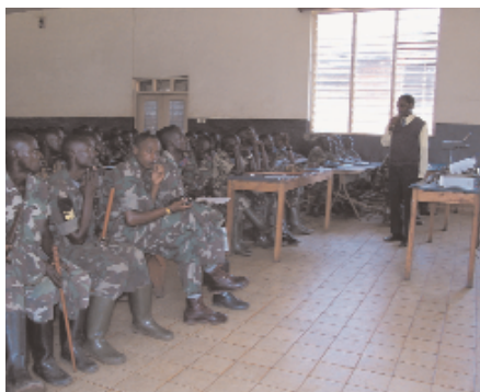
IHL dissemination session at Ntendezi Cyangugu. 20.02.03