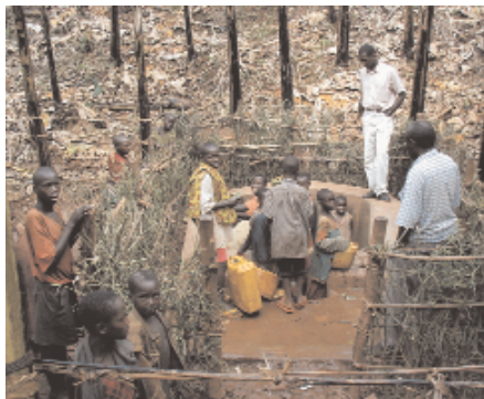
Water tap at Kigarama, Kibungo.