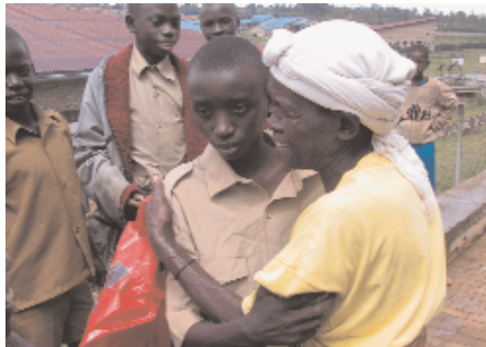
Repatriated child reunited with her grandmother in Gitarama. 29.10.03