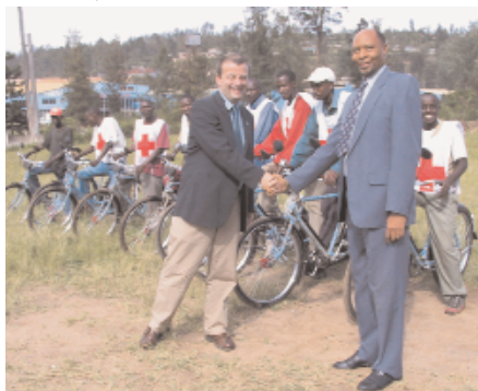
Handing over 235 bikes to RRC 28.10.03