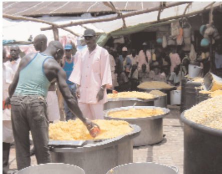
Meal in C.P. Gisovu. 04.03.03