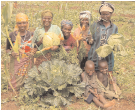
Women's association Cyangugu. 07.02.03