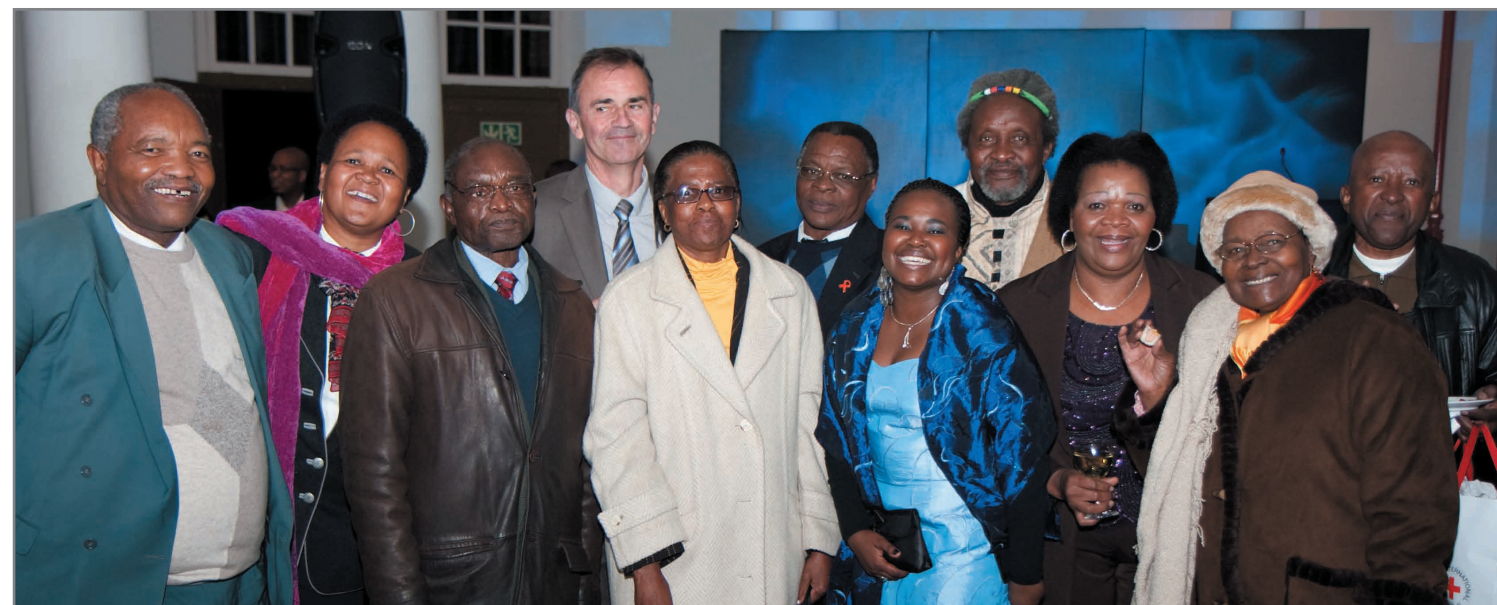
Former political prisoners of the Women's jail and Robben Island interact with ICRC employees.