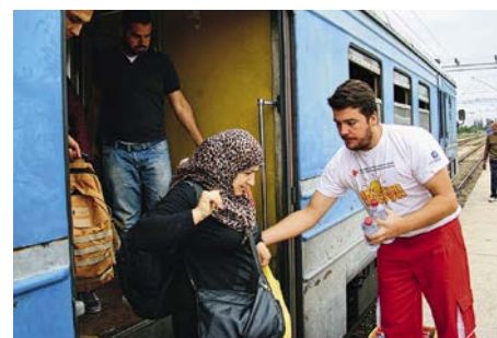
8. 'Anywhere that is safe'