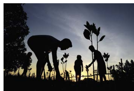
20. A planet of extremes