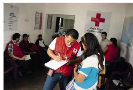
12. The border of broken dreams