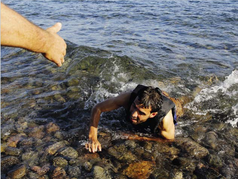
🔊 A local man helps an exhausted Syrian refugee who jumped off a dinghy and swam to the beach on the Greek island of Lesbos in late September.