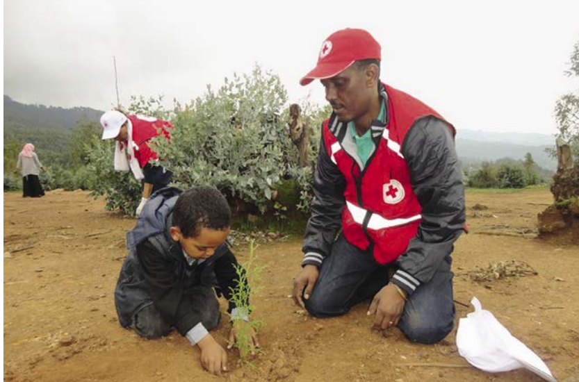
➡ A volunteer with the Ethiopian Red Cross Society helps a young boy plant a tree as part of a programme to encourage volunteerism and mitigate the effects of climate change. Also well known for its ambulance services and its response during major emergencies, the National Society is exploring ways to develop sustainable in-country funding and strengthen its organizational capacity from the ground up.

in which they come to consensus on where the National Society stands on a set of 85 specific organizational attributes, from volunteer development to fundraising and risk management.