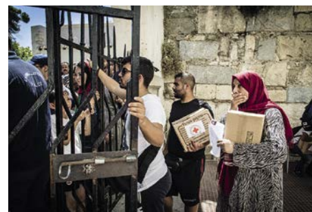
4. Dying for a better life

Strengthening healthcare after Ebola; how better to manage epidemics; and more.