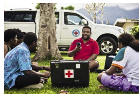
26. A stronger base for local action

Articles, letters to the editors and other correspondence should be addressed to: