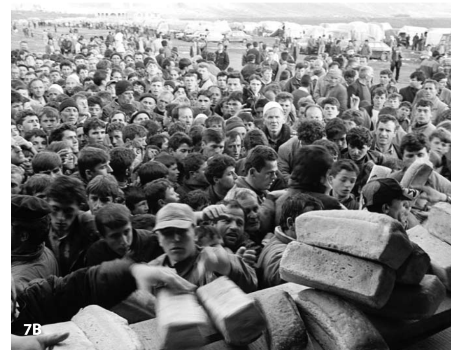
1B Lining up at the dispensary, Nyarushishi camp, Rwanda, 1994. 2B Water distribution, Quiha camp, Ethiopia, 1985. 3B School near the front line, Azerbaijan, 1997. 4B Food distribution to internally displaced people, El Salvador, 1984. 5B Victim of an anti-personnel mine, Kien Khlaing, Cambodia, 1994. 6B A woman checks the list of people who have received Red Cross messages, Mogadishu, Somalia, 1995. 7B Distribution of bread to refugees from Kosovo, Albania, 1999.