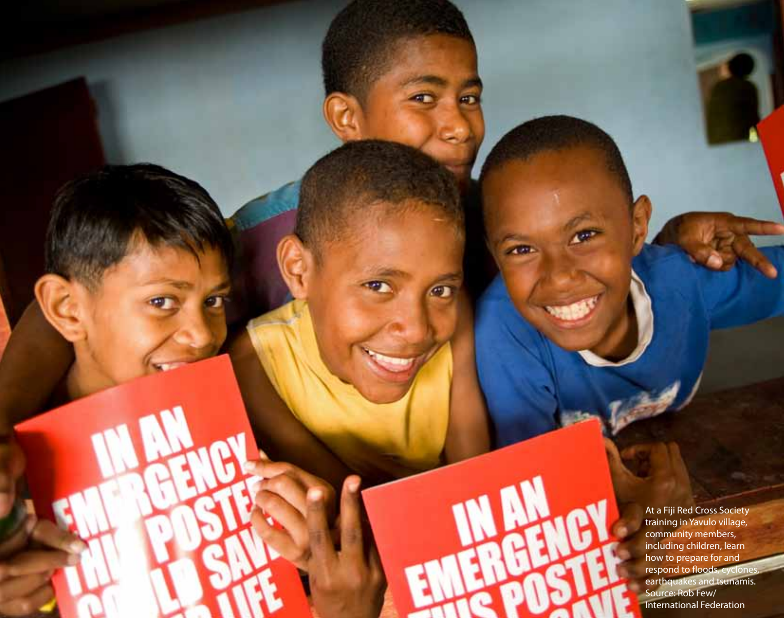
At a Fiji Red Cross Society training in Yavulo village, community members, including children, learn how to prepare for and respond to floods, cyclones, earthquakes and tsunamis.

impact upon the large number of communities who depend upon subsistence farming, fishing and tourism. Women have been found to be particularly vulnerable to natural disasters. They are 14 times more likely than men to die during natural disasters. Research has shown that when families are displaced by disasters, women face increased physical violence. Many communities in the region experience the consequences of climate change, environmental degradation, large-scale natural resource extraction, diminishing fish stock, fresh water shortages and inadequate waste disposal systems.