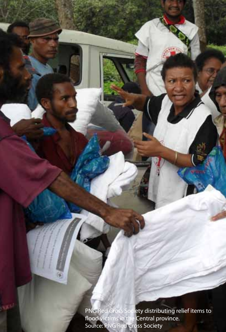
PNG Red Cross Society distributing relief items to flood victims in the Central province.