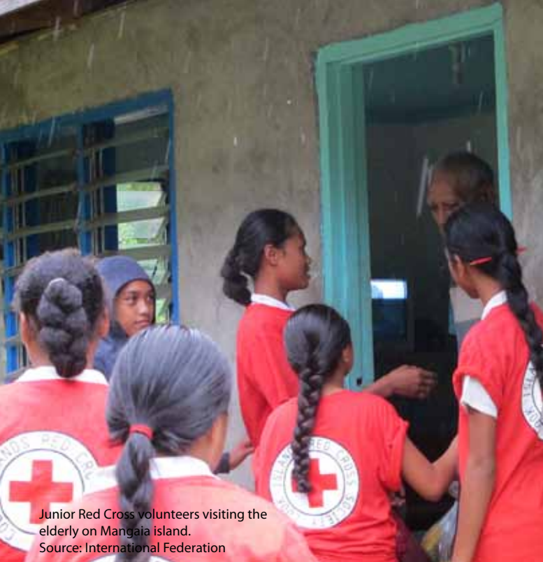
Junior Red Cross volunteers visiting the elderly on Mangaia Island.