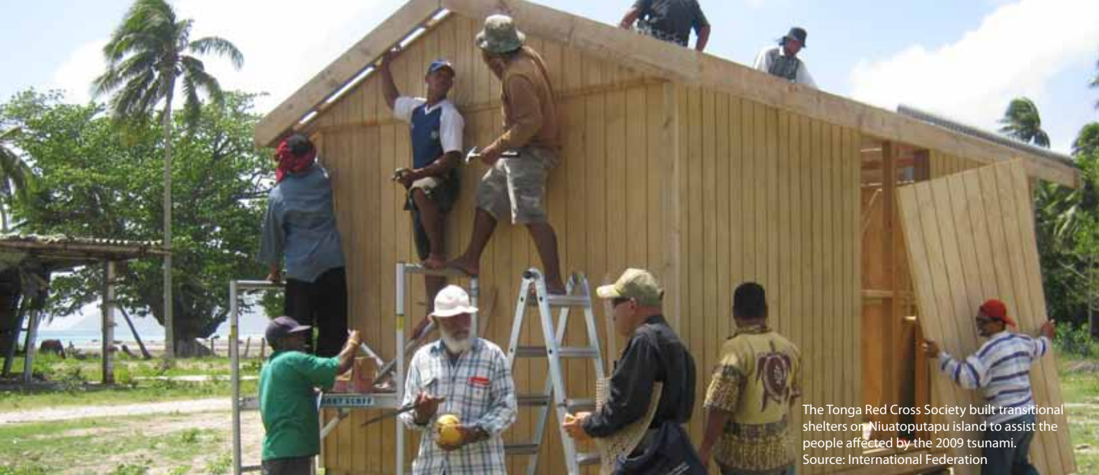
The Tonga Red Cross Society built transitional shelters on Niuatoputapu island to assist the people affected by the 2009 tsunami.