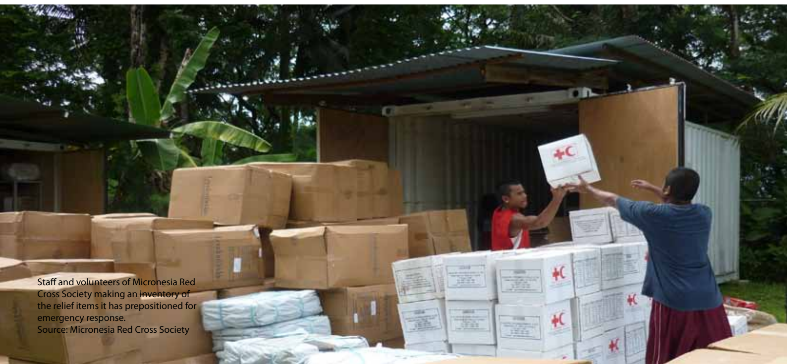
Staff and volunteers of Micronesia Red Cross Society making an inventory of the relief items it has prepositioned for emergency response.

Population: 110,000 2008 Gross domestic product (PPP) per capita: Int $3,088 2009 Human development index ranking: 103 2010