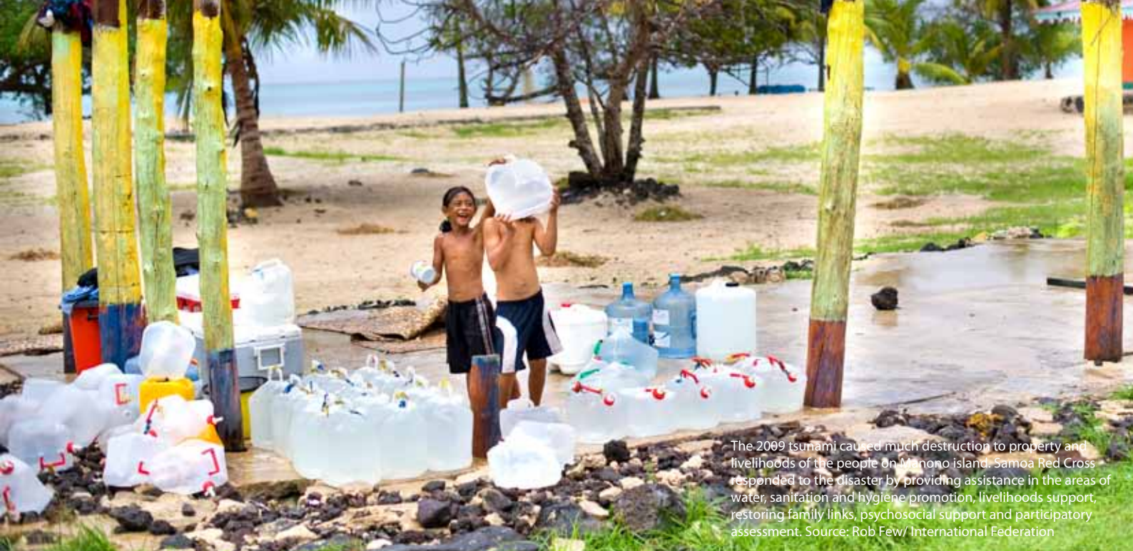
The 2009 tsunami caused much destruction to property and livelihoods of the people on Manono island. Samoa Red Cross responded to the disaster by providing assistance in the areas of water, sanitation and hygiene promotion, livelihoods support, restoring family links, psychosocial support and participatory assessment.