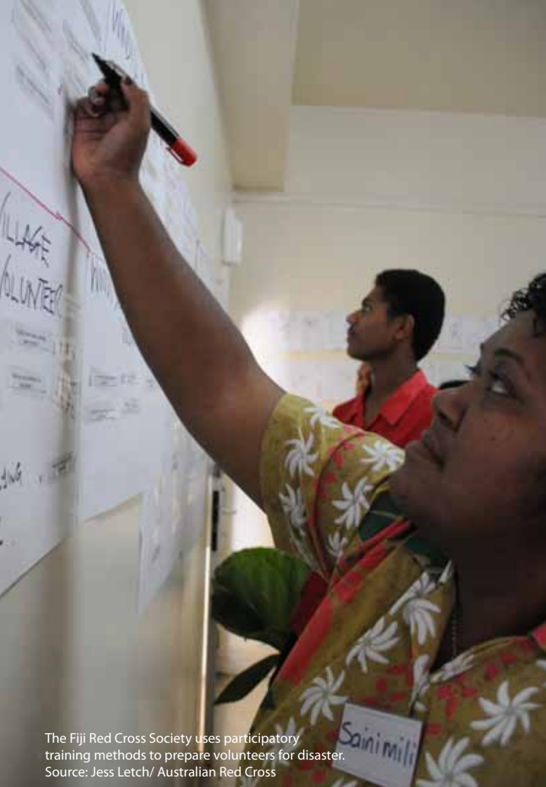
The Fiji Red Cross Society uses participatory training methods to prepare volunteers for disaster.