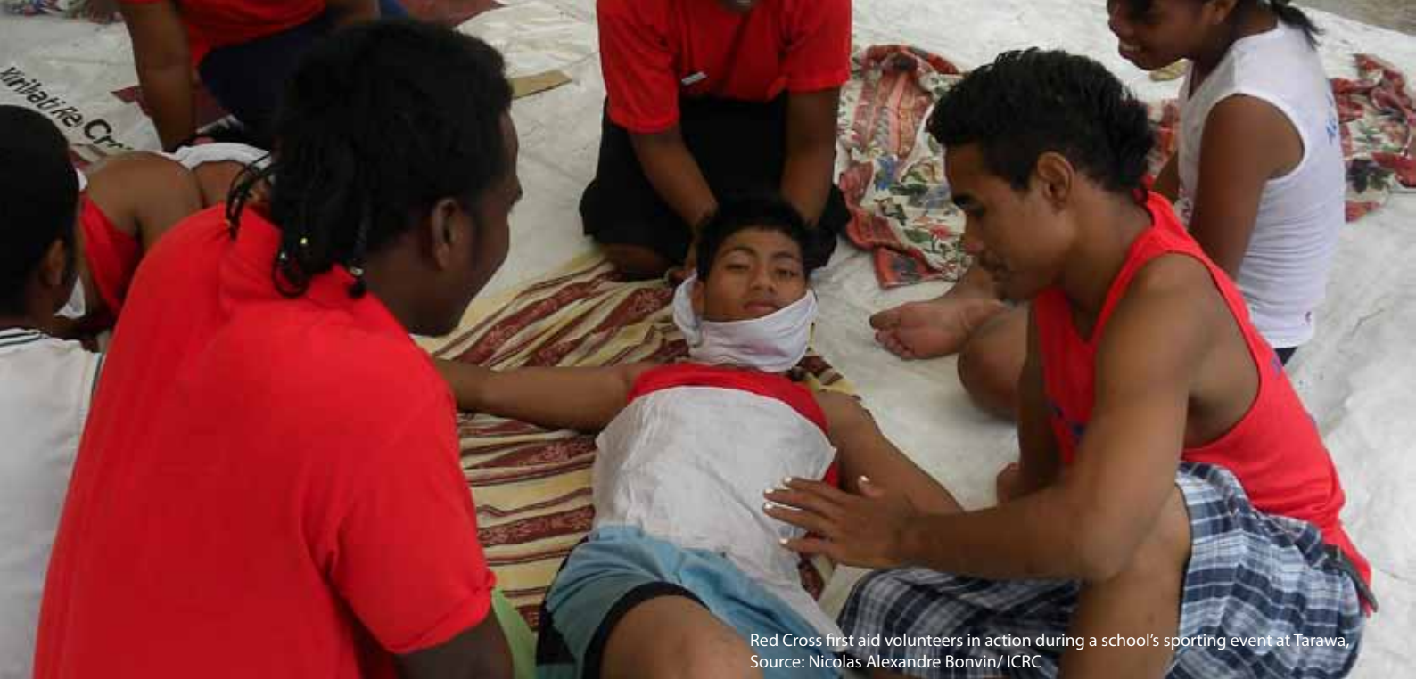
Red Cross first aid volunteers in action during a school's sporting event at Tarawa.