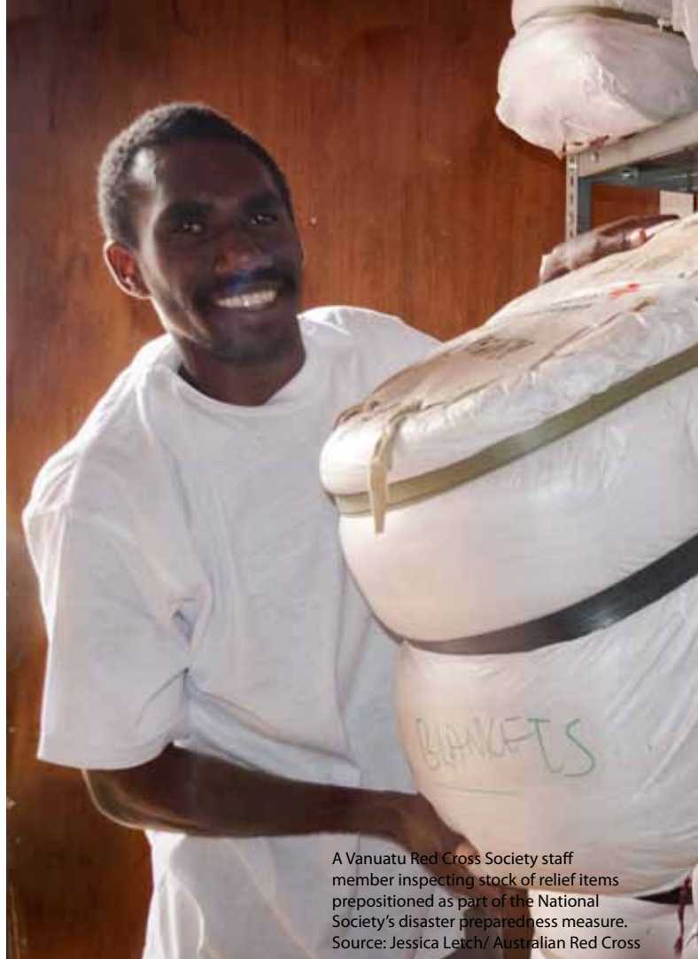
A Vanuatu Red Cross Society staff member inspecting stock of relief items prepositioned as part of the National Society's disaster preparedness measure.

Originally a branch of the British Red Cross, the Vanuatu Red Cross Society was formed in 1982 after the country's independence. In January 2010, the National Society received full recognition from the Government of the Republic of Vanuatu as a voluntary relief society, auxiliary to the public authorities, and the only National Red Cross Society that can carry out its activities in Vanuatu. A memorandum of understanding was signed between the Republic of Vanuatu and the Vanuatu Red Cross Society.