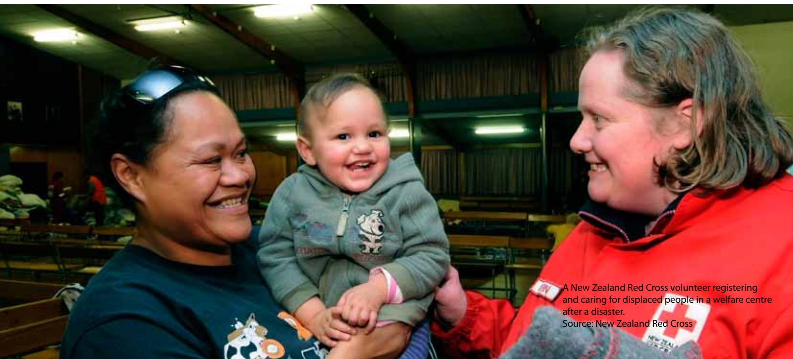
A New Zealand Red Cross volunteer registering and caring for displaced people in a welfare centre after a disaster.