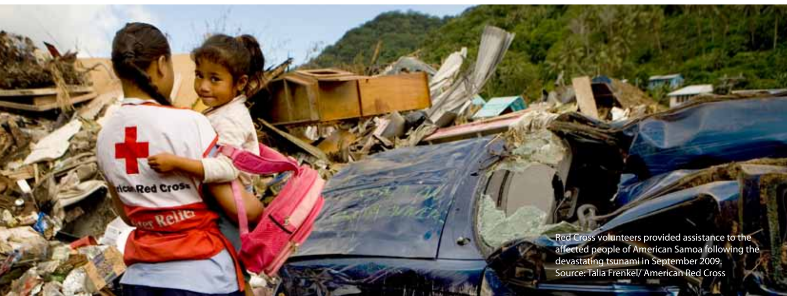
Red Cross volunteers provided assistance to the affected people of American Samoa following the devastating tsunami in September 2009.

Through its headquarters in Washington DC, the American Red Cross provides development assistance to National Societies in the Pacific region. It has prioritized capacity building in disaster management, funding technology improvements, the regional disaster response team initiative and placing staff with the International Federation in Suva and Kuala Lumpur. The American Red Cross has also helps to train National Societies in the region.