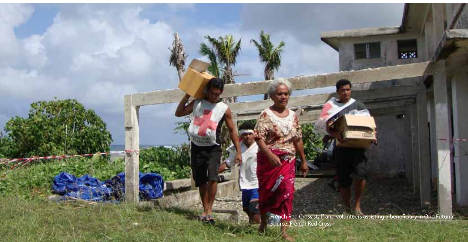
French Red Cross staff and volunteers assisting a beneficiary in Ono Futuna.

PIROPS provides training in logistics and relief for Pacific island National Societies, and has deployed staff to assist emergency assessments and disaster response. With eight delegates based in four countries, French Red Cross is cooperating on disaster management programmes with National Societies in the Solomon Islands, Vanuatu, Tonga and Samoa