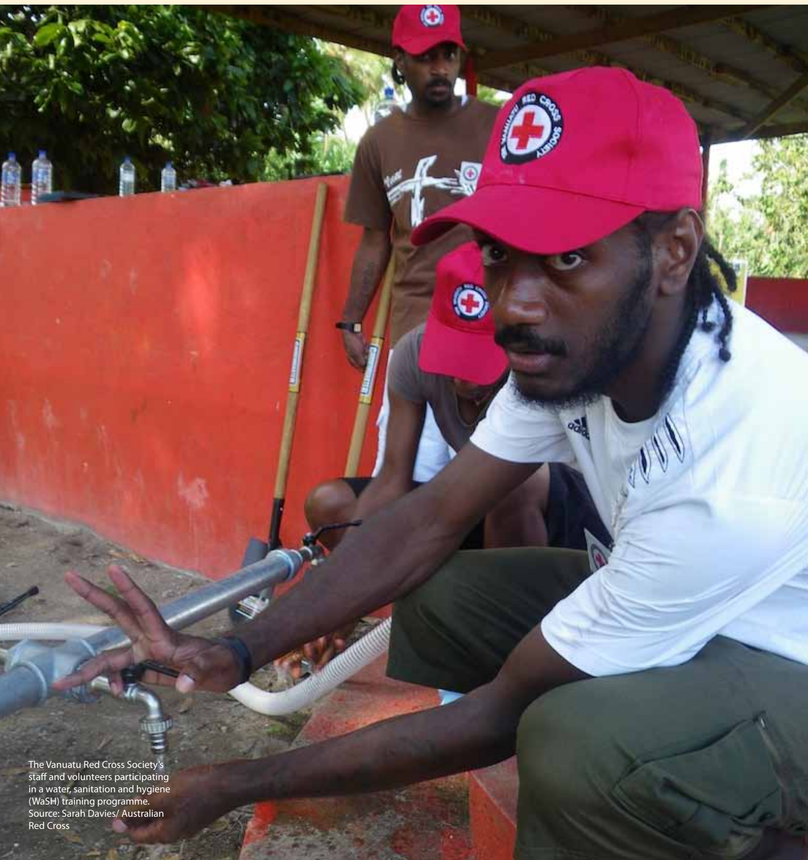
The Vanuatu Red Cross Society's staff and volunteers participating in a water, sanitation and hygiene (WaSH) training programme.

Pacific island National Societies are community-based organizations that deliver a range of programs adapted to each country's context, in the areas of disaster management, disaster risk reduction, health and social welfare. Through branch and national leadership structures, Red Cross National Societies contribute to sustainable development by reducing vulnerability and bolstering community resilience. With Red Cross support, communities are better able to adapt and cope with threats and crises, thus preserving their development gains.