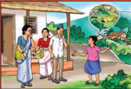
Inform adults or the authorities immediately so that no one else is killed or injured.