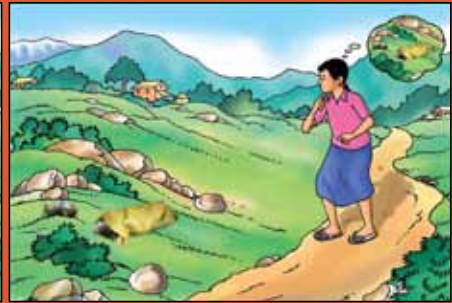
Remember the the exact place!