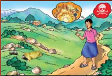
Do not approach it!