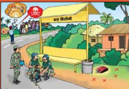
Only the Nepal Army and Armed Police Force have the capacity to deal with and dispose of the explosive devices safely.