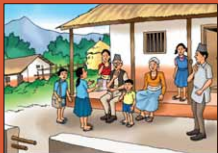
Do not forget to share these basic safety messages with your families, friends and neighbours.